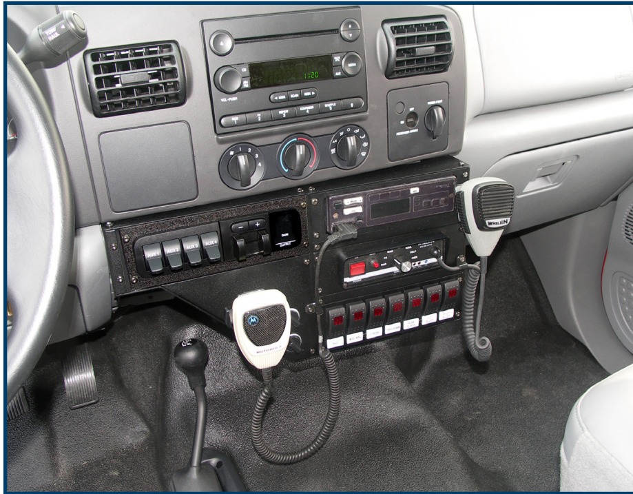
C-VS-0309-F250 shown with optional mic clip brackets.