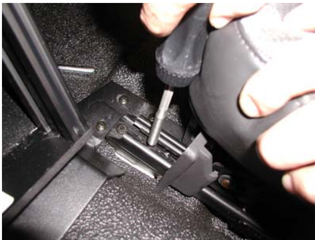
Tighten the 10-32 x 3/4" Phillips machine screw that was loosely attached earlier