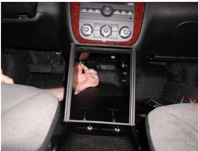
Attach forward section of console using tabs on console and existing holes on vehicle.