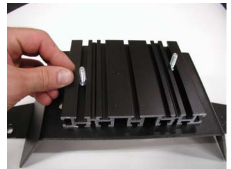
Attach the 4.5" section of trak to the C-B43 transmission hump bracket using (4) 1/4-20 x 1/2" bolts and serrated nuts. Slide (2) 1/4-20 x 3/4" bolts into slots of trak for console mounting. Note: Make sure wider slots are used for mounting console. Narrow slots are used 2 for hump bracket.