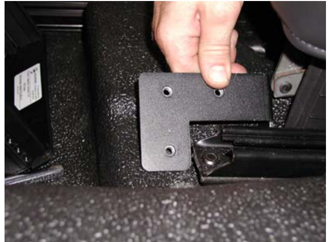
Slide under seat support brackets into position as shown