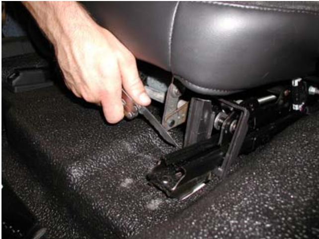
Cut a slit in the floor, next to the seat rail to allow Under seat support bracket to slide under seat rail