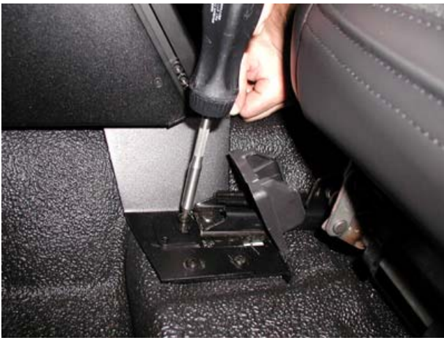
Attach C-B43 to Under seat support brackets using (3 per side) 1/4-20 x 3/4" Phillips machine screws and flat washers