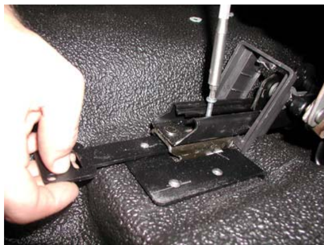
Loosely assemble Guide bracket by sliding into lower side of seat rail. Loosely attach #10 x 3/4" phillips machine screw and washer through seat rail hole to nutsert on Guide bracket.