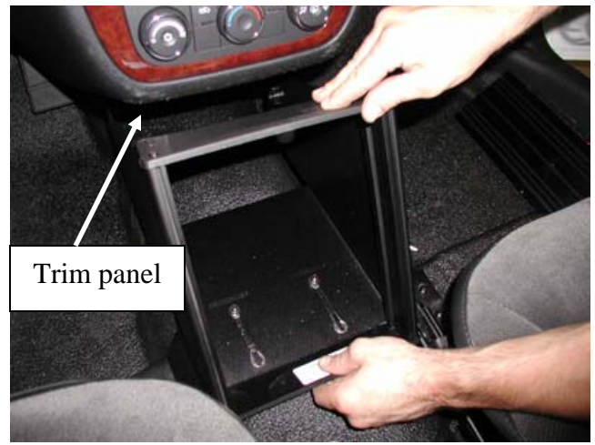
Remove the plastic trim panel containing the OEM lighter plugs. Slide (2) 1/4-20 x 3/4" Hex bolts into trak slots. Position console on top of 4.5" section of trak over hex bolts and attach 1/4" serrated nuts. Slide console tight to dash.