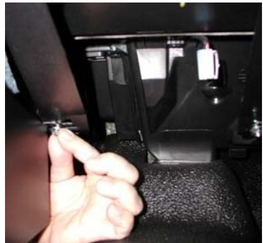
Attach using 1/4-20 x 3/4" Hex bolts and serrated nuts and tighten