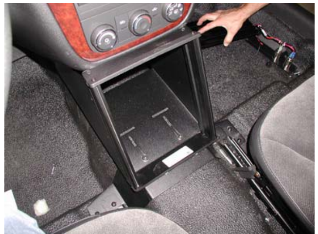
Finished look of C-VS-1000-IMP-1 console