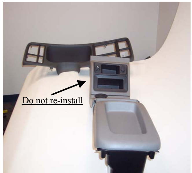
These are the components that need to be removed for install.