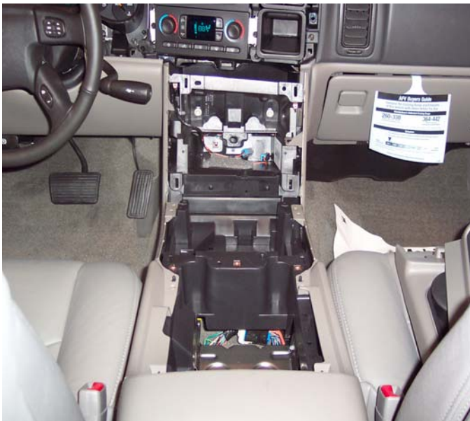
This is what you should see at this point.

Note: After armrest/accessory pocket piece is unscrewed press forward and pull up to remove.