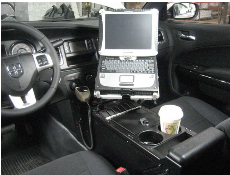
Completed console installation with Laptop / Docking Station