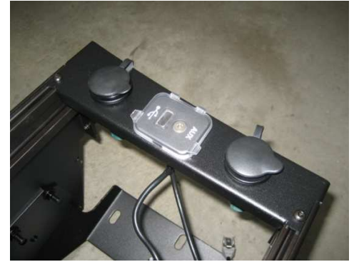
Firmly push in the O.E.M 12 volt sockets and Auxiliary socket assembly into center End Panel Cutout. "AUX" lettering goes to passenger side.