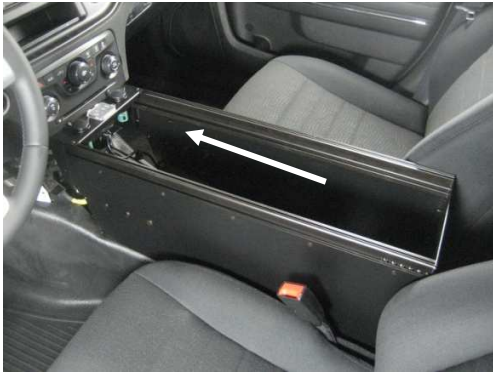
Push Console assembly forward and tighten all floor mount bracket hardware. Run wiring as needed.