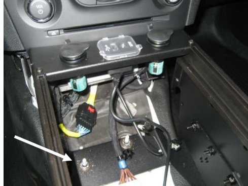
Carefully place console assembly between seats and onto front O.E.M. floor studs. Loosely attach previously removed nuts onto floor studs. (10mm)