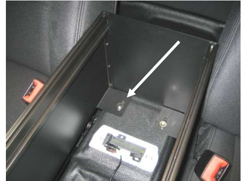
Use 1/4 x 3/4 self threading screws (included in hardware kit) to loosely attach rear of console to existing floor inserts. Inserts located under rubber mat as shown. (7/16 socket)