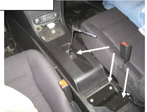
Remove bolts that hold underside of extrusion to rear floor bracket. (7/16 wrench) Remove rear floor bracket bolts and center console bolt. (10mm)