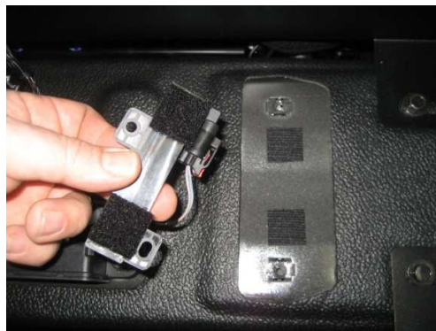
On 2011 Charger, attach Ignition proximity sensor /antenna to transmission hump with Velcro.

NOTE: 2012 and newer cars include an O.E.M. bracket with this sensor already relocated. Velcro mounting will not be