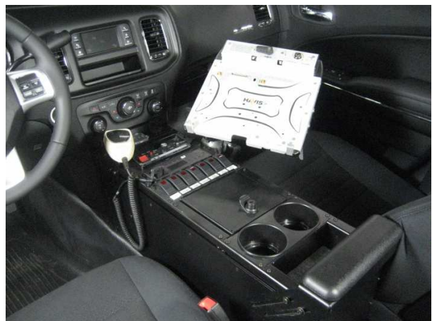
Completed console installation with Docking Station.