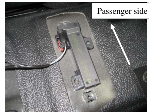
Attach Sensor to transmission hump.

NOTE: 2012 and newer cars include an O.E.M. bracket with this sensor already relocated. Velcro mounting will not be