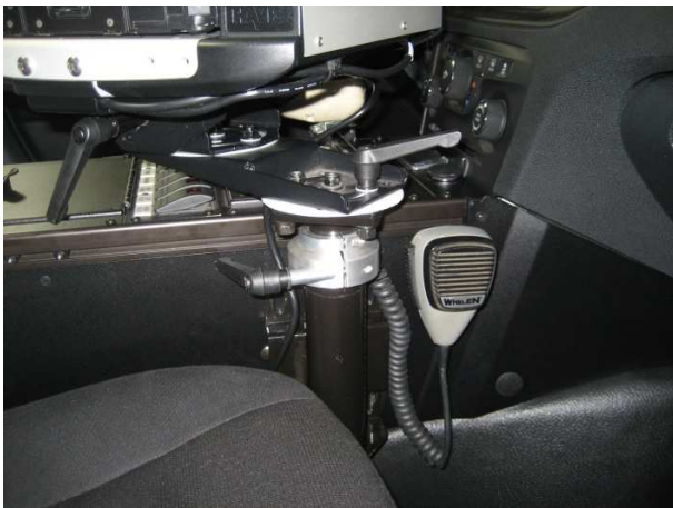
View of passenger side mounted C-HDM-204, C-HDM-303 and C-MD-202.