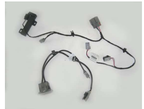
Remove sensor and 12 volt socket wire harness assembly from under side of O.E.M. console. Pop out "AUX" socket from center of O.E.M console.