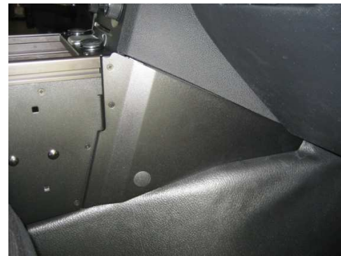
Attach passenger side trim panel on with # 8 x 1/4 Flat Head Screws. (included with hardware kit) (Phillips Screwdriver) After console housing is firmly mounted, remove panel as needed to run wires