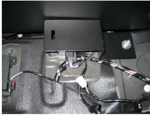
A Cover is provided to guard the O.E.M. Sensor on transmission hump. Attach to existing stud and 6mm nut and washer provided.