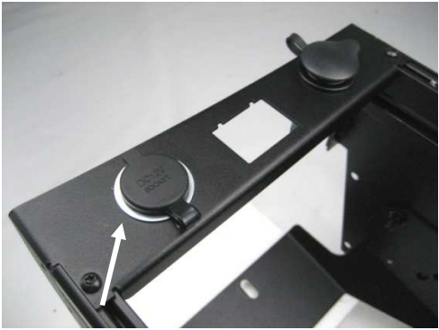
Two (2) aftermarket 12 volt socket kits #C-HK-184 are included with this Charger console. The installer has the option to use either the OEM or Aftermarket 12 volt sockets. (C-HK-181 socket shown installed)