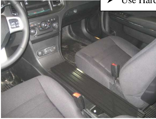
O.E.M. console prior to C-VS-2400-CHGR-2 installation.