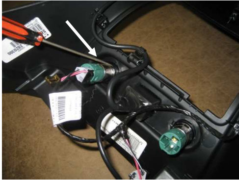
Carefully remove O.E.M. 12 volt sockets and "AUX" socket from OEM plastic panel. Small flat screwdriver can be used to push sockets out.