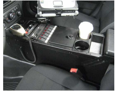
Install Control heads and accessories. If necessary, remove side trim panel for easier wiring access during installation