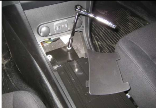
Remove forward O.E.M console plastic cover and remove two (2) nuts from front floor bracket. Nuts to be reused. (10mm)