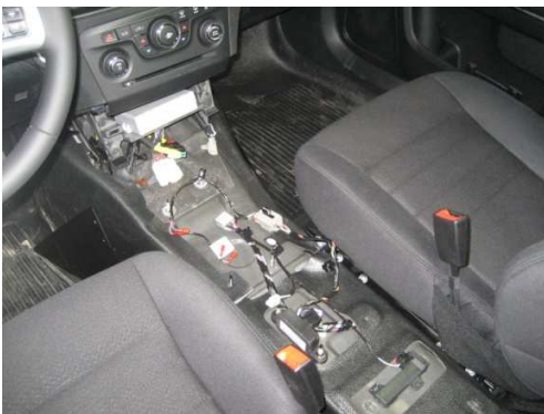
Plug O.E.M. wire harness back onto original connectors.