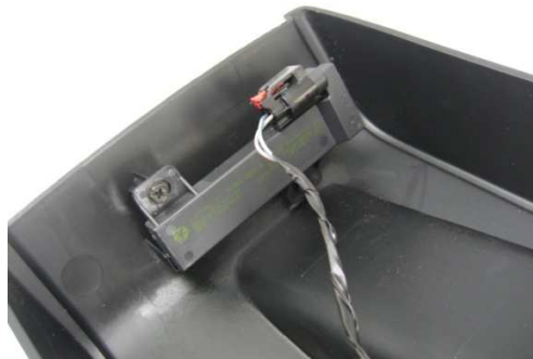
Remove Ignition proximity sensor / antenna from rear underside of O.E.M. console. (Phillips Screwdriver) ** SEE NOTE BELOW **