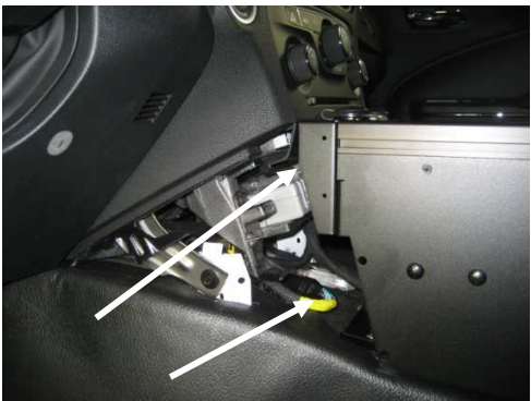
Plug 12 volt sockets and "AUX" USB connectors back together.