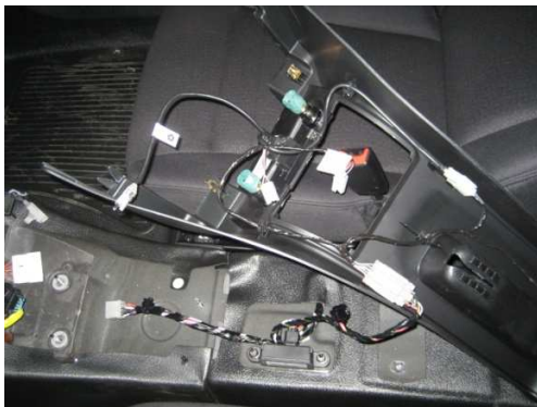
Remove O.E.M. plastic center console