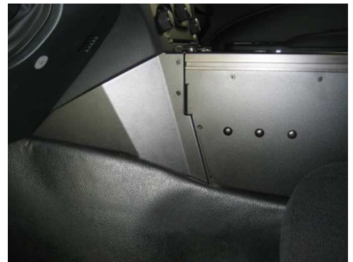
Attach driver side trim panel on with # 8 x 1/4 Flat Head Screws. (included with hardware kit) (Phillips Screwdriver) After console housing is firmly mounted, remove panel as needed to run wires