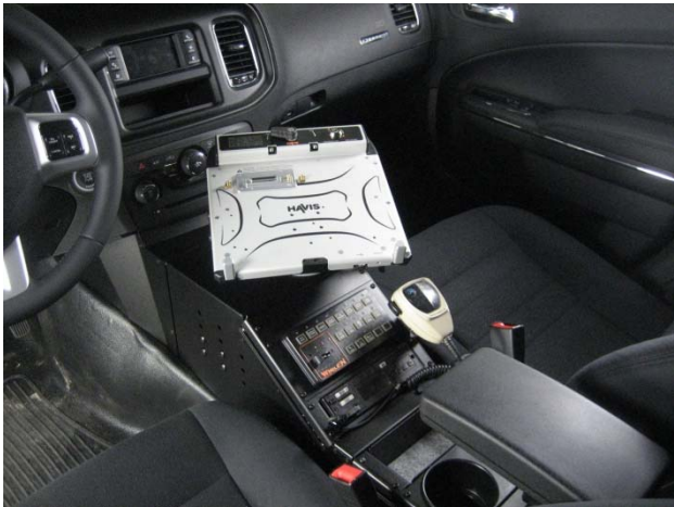
Console assembly complete with Docking Station.