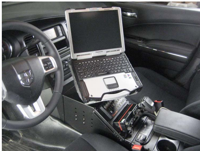
Completed C-VS-0809-CHGR-1 console installation with Laptop / Docking Station (example 2)