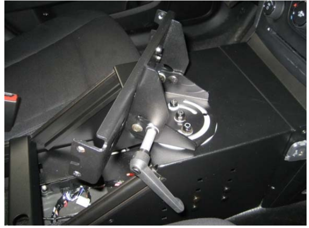
Prior to installation of control heads and accessories, determine desired position and attach Tilt/Swivel and Docking Station bracket.