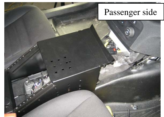
Carefully place console assembly between seats and onto front O.E.M. floor studs.

NOTE: 2012 and newer cars include an O.E.M. bracket with this sensor already relocated. Velcro mounting will not be needed