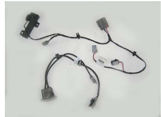
Remove sensor and 12 volt socket wire harness assembly from under side of O.E.M. console. Pop out "AUX" socket from center of O.E.M console.