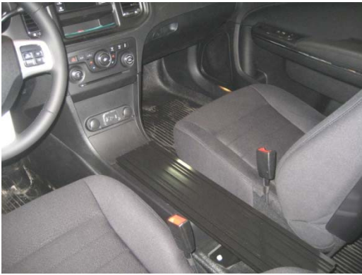
O.E.M. console prior to C-VS-0809-CHGR-1 console installation.