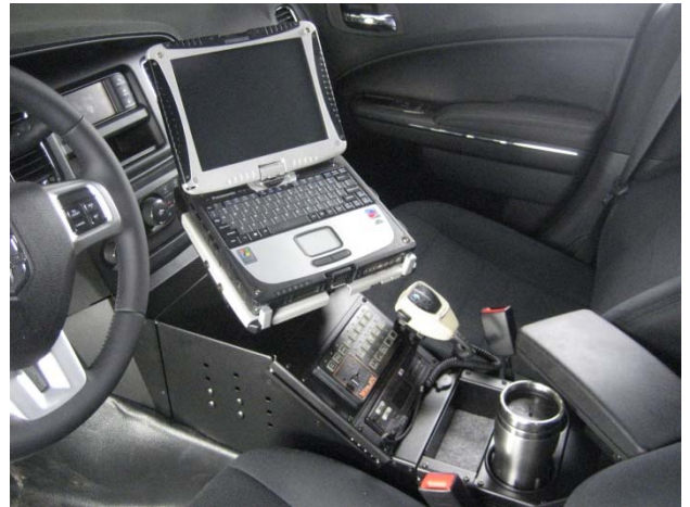
Completed console installation with Laptop / Docking Station (example 1)