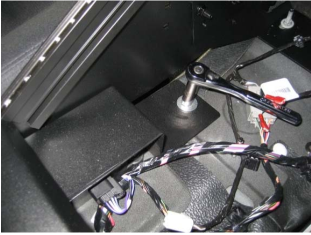
A cover is provided to guard the O.E.M. Sensor on transmission hump. If desired, attach to existing stud and 6mm nut and washer provided.