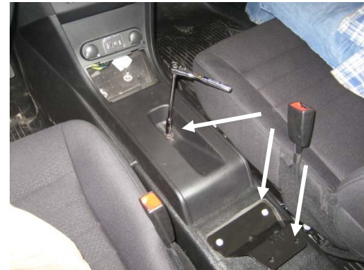
Remove bolts that hold underside of extrusion to rear floor bracket. (7/16 wrench) Remove rear floor bracket bolts and center console bolt. (10mm)