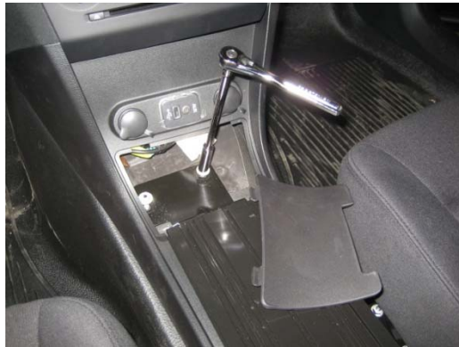
Remove forward O.E.M console plastic cover and remove two (2) nuts from front floor bracket. Nuts to be reused. (10mm)