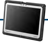
DS-PAN-1200 SERIES Toughbook 33 Tablet only