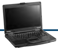
DS-PAN-420 SERIES Toughbook 54