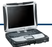
DS-PAN-220 SERIES Toughbook CF-19