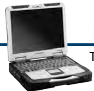
DS-PAN-110 SERIES Toughbooks 30 & 31