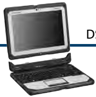
DS-PAN-1000 SERIES Toughbook 20 2-in-1 Laptop