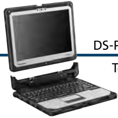
DS-PAN-1100 SERIES Toughbook 33 2-in-1 Laptop