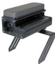
Top Mount Arm Rest with Printer Bracket (C-ARPB-101 shown)