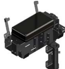
Side Mounted Pedestal Arm Rest with Printer Bracket (C-ARPB-106 shown)