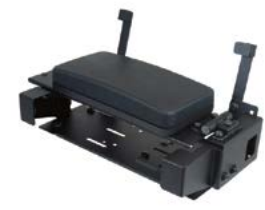
Flat Surface Mounted Armrest with Printer Bracket (C-ARPB-112 shown)