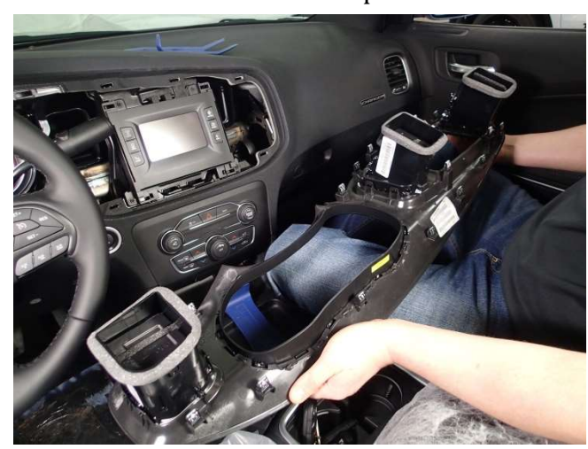
Reseat the vents in their appropriate locations.