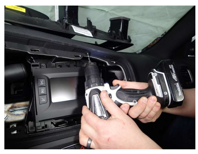
Use 1/8" drill bit and carefully drill your pilot holes.