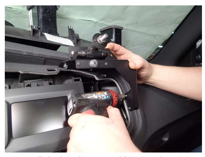
Install the bracket assembly using four (4) 10 \times 3/4 " Self tapping screws.