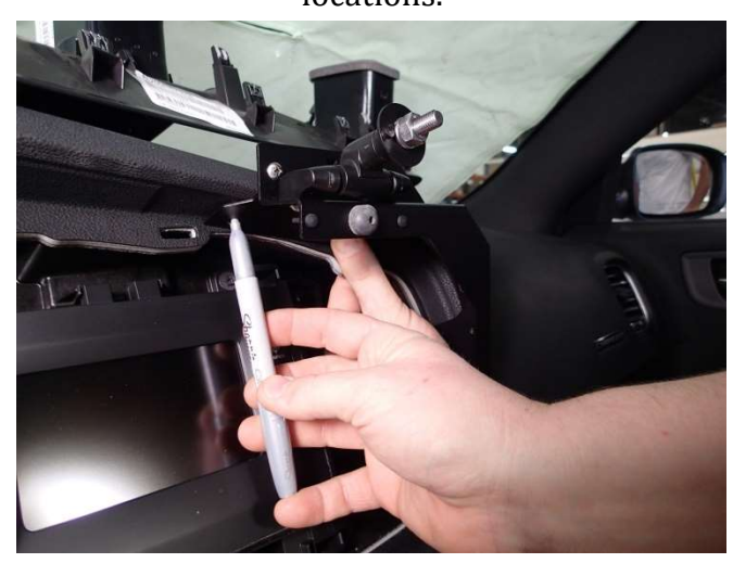
Mark holes to be drilled with a paint marker.