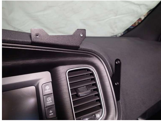
Carefully re-install dash bezel