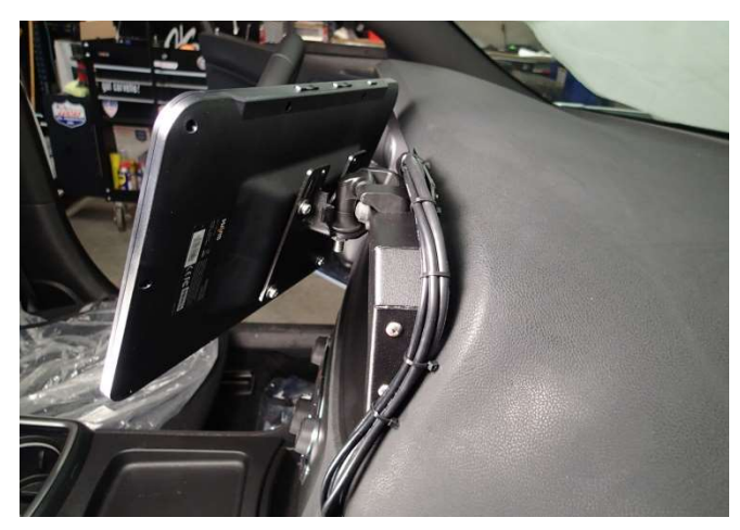
Wire tie / strain relief the harnesses to main mount bracket.