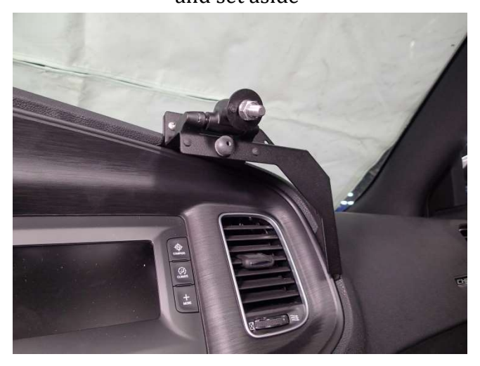
Re-install previously removed frame bracket