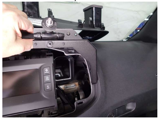
Hold C-DMM-2004 bracket assembly up to inside lip on dash the determine approximate mounting location.