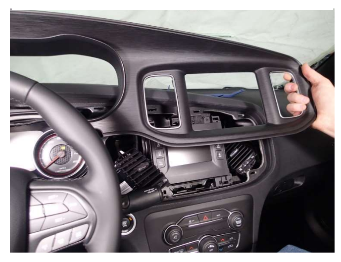
Remove dash bezel. The vents may stay in the dash upon removal.