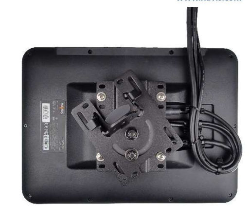
Attach pivot / display mount bracket to display with M4 \pm 0.7 \pm 10mm Phillips head machine screws, lock washers and flat washers. Display mount hardware is included with TSD-101 hardware kit.