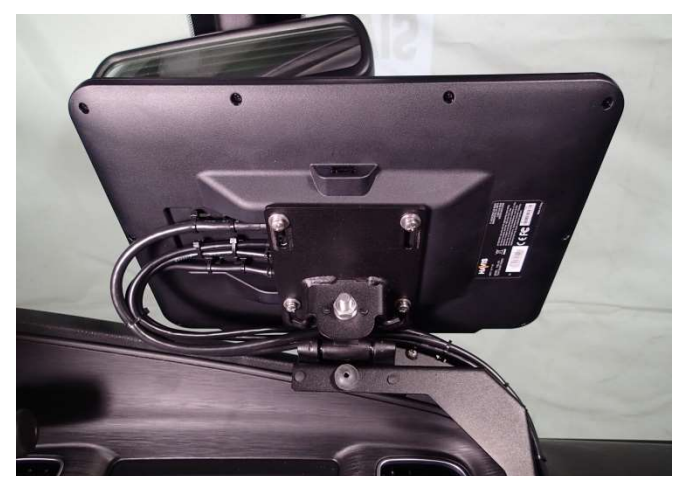
Attach bracket with display to the tilt swivel hinge with M8 hex nut and lock washer. Tighten nut and attach vinyl cap on M8 bolt threads.