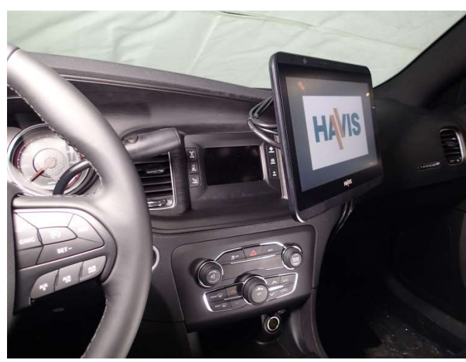
Refer to TSD-101 owner's manual for power and computer connection details.