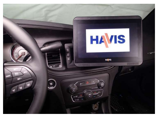
Installation of C-DMM-2004 with TSD-101 complete.