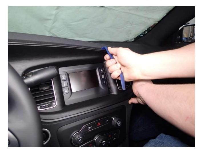
Gently pry along the edges of the dash to release the clips.