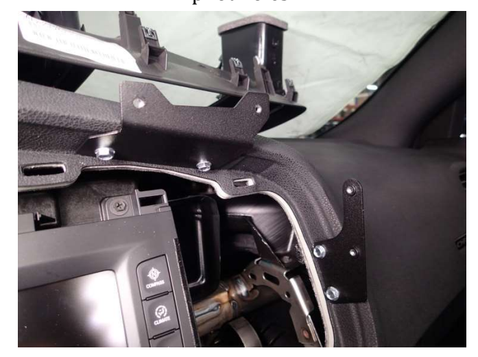
Unscrew the display mount frame bracket and set aside