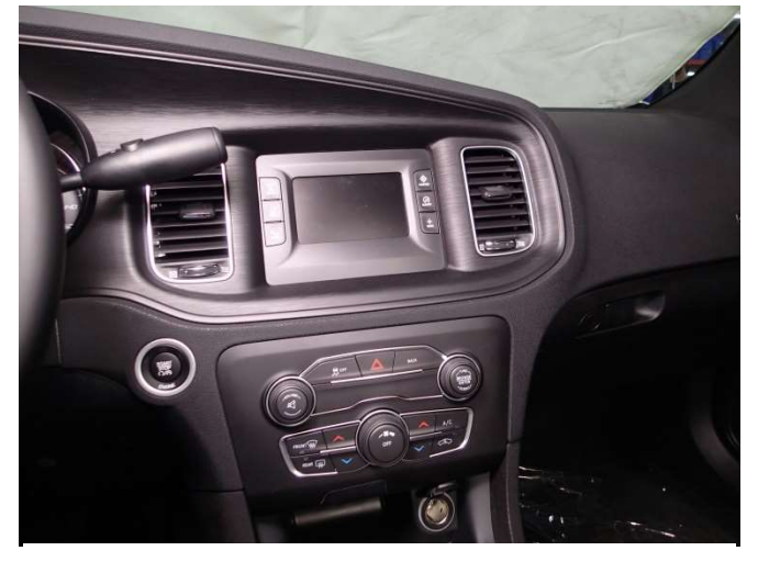
View of Charger dash before removal