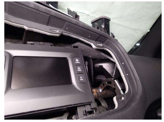
Verify your marks before drilling