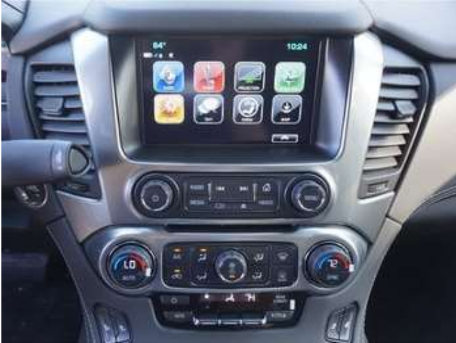
OEM Dash Prior to installation