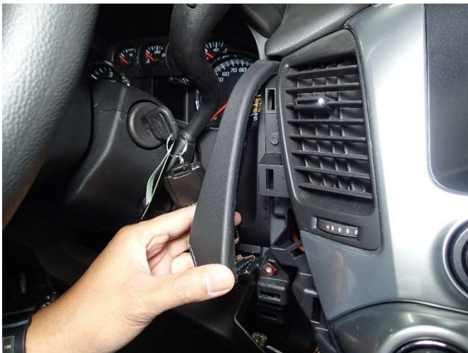
Remove driver side upper dash panel.