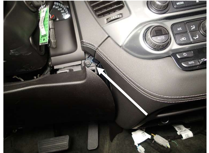
Pull back the driver side lower dash panel to gain access and remove side trim screw (7mm socket)