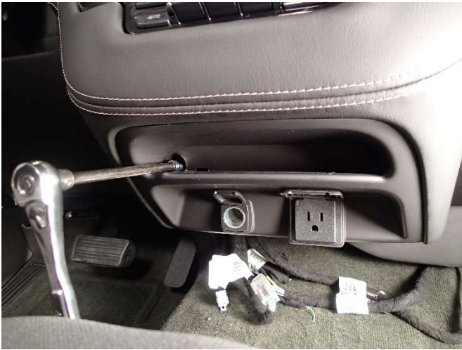
Remove rubber cover in lower accessory pocket to gain access and remove two (2) lower dash panel screws. (7mm socket)