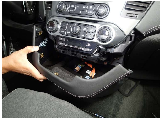
Pull lower dash panel towards you to remove.