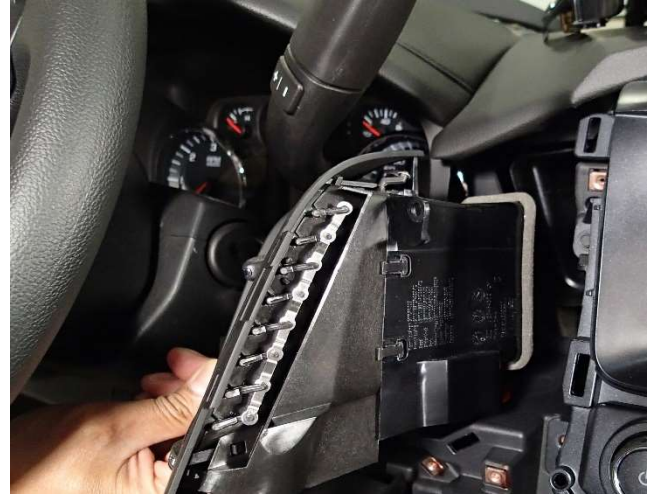
Remove three (3) screws from the vent housing and remove the housing. Repeat for passenger side. (7mm socket)