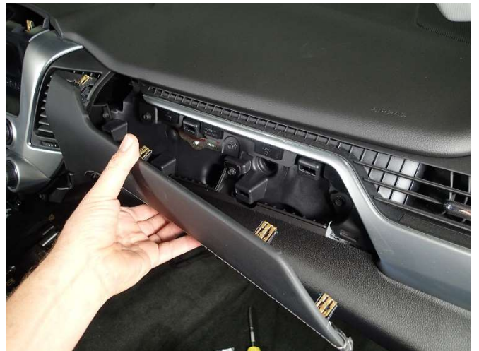
Insert a flat blade panel removal tool and remove the panel above the glove box.