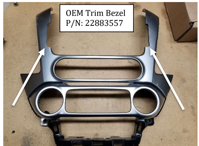
Carefully notch trim bezel accordingly and reinstall back into dash. Reinstall all vents and dash trim. File or Dremel tool works well for notching plastic.