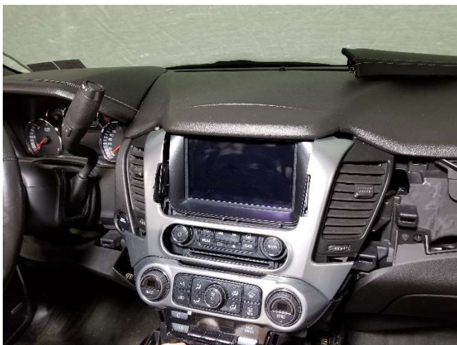
Loosely place the center trim bezel up to the dash and mark the area around the upper side brackets.