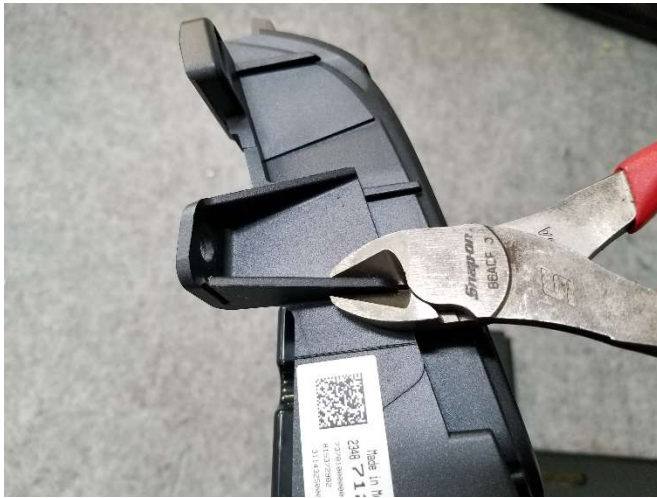
On the 2017 and older Tahoe, (2) plastic tabs will need to be trimmed. This can be done with a simple snip from a pair of diagonal cut pliers