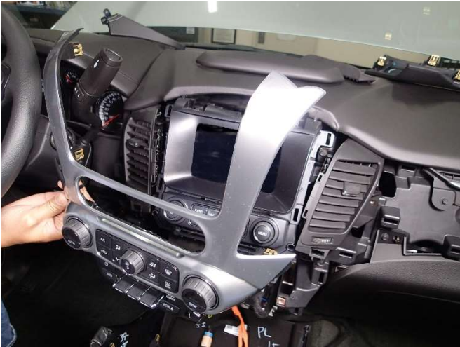
Carefully remove (unsnap) center trim bezel around touch screen and climate controls