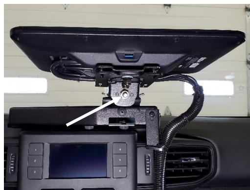
Attach bracket with display to the tilt swivel hinge with M8 hex nut and lock washer. Tighten nut and attach vinyl cap on M8 bolt threads.