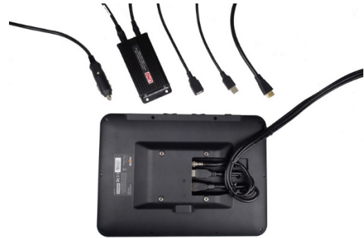
Connect harnesses to the back of the TSD-201 display. It is important to also double wire tie the harnesses to provide sturdy strain relief for the plugs.