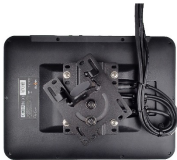
Attach pivot / display mount bracket to display with M4 x 0.7 x 10mm Phillips head machine screws, lock washers and flat washers. Display mount hardware is included with TSD-201 hardware kit