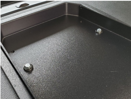
Repeat process for other side.