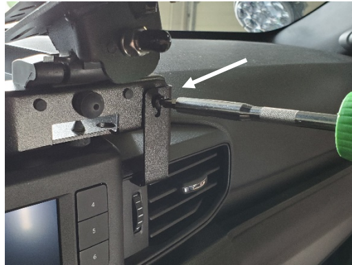
Attach dash clamp support bracket to Main bracket with 10-32 x 1/2" machine screws and star washers.