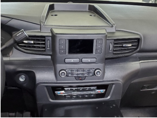
View of Interceptor Utility before installation