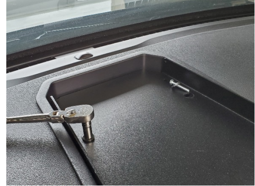
Place DMM tray in place and attach using M5 x 30mm bolts and 1/4" washers. 8mm socket