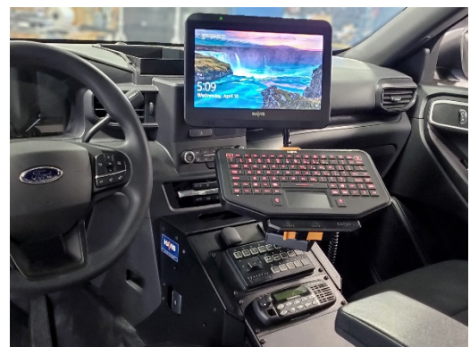
Refer to TSD-201 owner's manual for power and computer connection details.