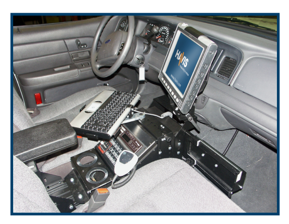
C-SM-830 shown with Motorola MW800 monitor & keyboard, and Pentax PocketJet printer