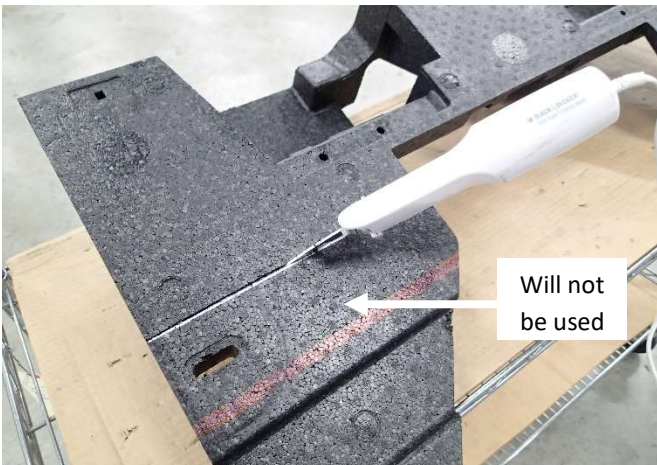
Cut both sides of foam block as shown.

Note: Foam is modified so platform mounting can be more secure and to help adapt better to rear partitions.