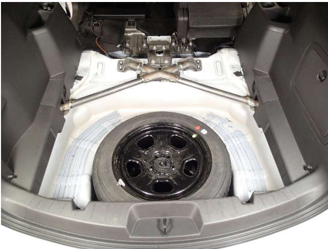
Remove forward floor cover, forward foam filler block and side foam filler blocks.