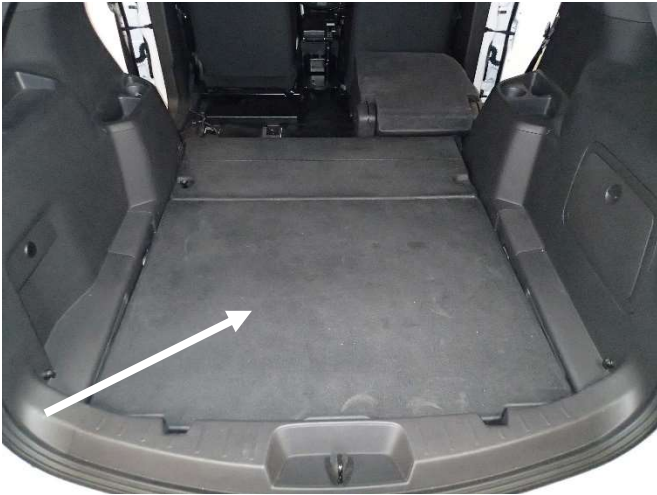
View of Interceptor Utility rear cargo floor. Remove main floor / spare tire cover.