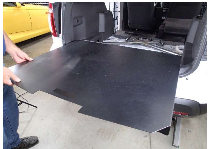
With gas springs closed, place the platform assembly into vehicle.

Note: Electric Steak Knife works well for cutting foam.