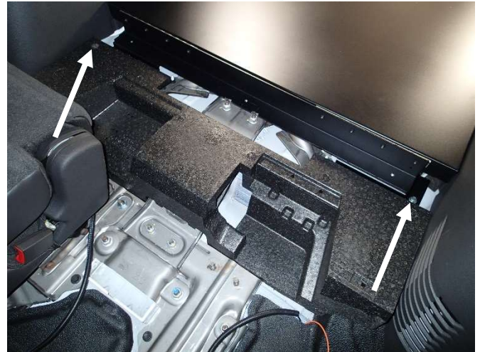
Attach bracket to floor with supplied 8mm x 35mm Hex bolts, 5/16 lock washers and 5/16 flat washers. Forward foam block shown back in original location.