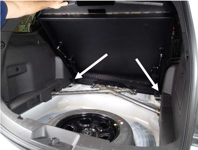
Forward mount bracket holes will line up with OEM holes for cargo floor panel previously removed.