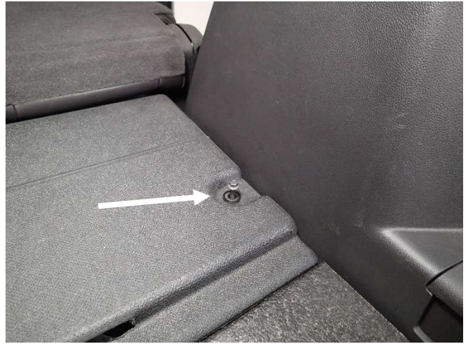
Remove forward floor cover panel by unbolting two (2) bolts and spacers. (8mm socket)