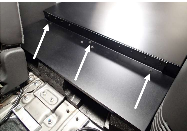
Install forward trim / filler panel CM005235 with three (3) 1/4" x 3/4" hex bolts, lock washers and flat washers.

Note: This filler panel can be modified or not used if necessary for other equipment mounting.