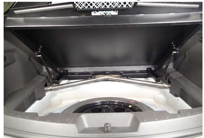
Snap gas spring onto ball mounts. Ball mounts should already be installed and are located on the underside of platform and lower support arms. (one each side)

Note: This filler panel can be modified or not used if necessary for other equipment mounting.