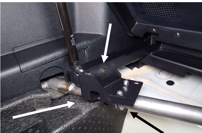
Attach support arm mount brackets to support arms with 1/4" x 3/4" hex bolts, flat washers and serrated nuts.

Note: The large diameter cylinder end attaches to the lower support bracket.