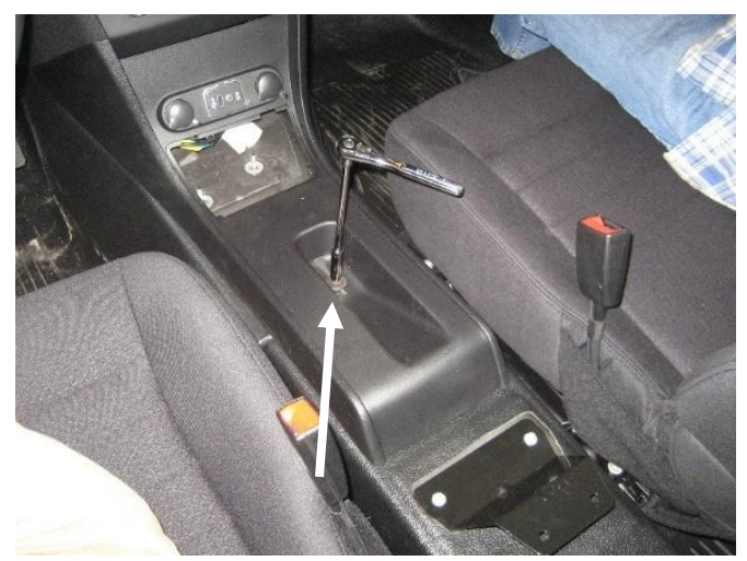
Remove bolts that hold underside of extrusion to rear floor bracket. (7/16 wrench) Remove rear floor bracket bolts and center console bolt. (10mm)