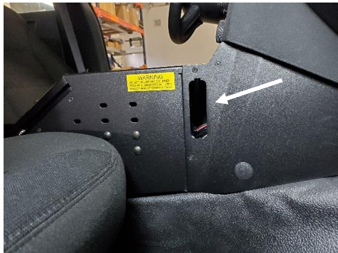
Attach passenger and driver side trim panels on with # 8 x 1/4 Flat Head Screws. (3 screws each panel included with hardware kit)