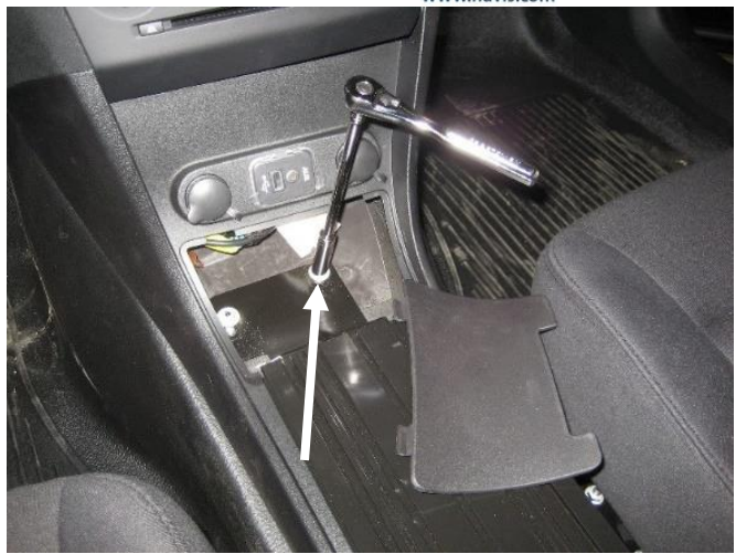
Remove forward O.E.M mini console plastic cover and remove two (2) nuts from front floor bracket. Nuts to be reused. (10mm)

Havis, Inc. 75 Jacksonville Road Warminster, PA 18974 T 800-524-9900 F 215-957-0729 www.havis.com