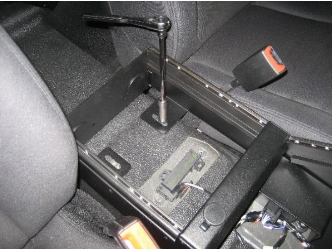
Use OEM screws (if provided) or 1/4 x 3/4 self threading screws (included in hardware kit) to mount rear of console. (7/16 wrench)