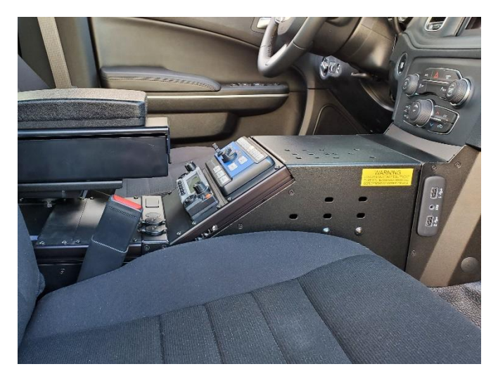
Installation is now complete.