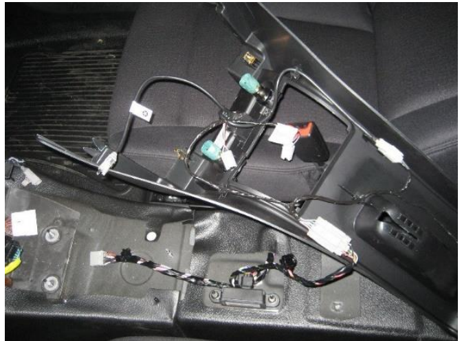
Remove O.E.M. plastic center console