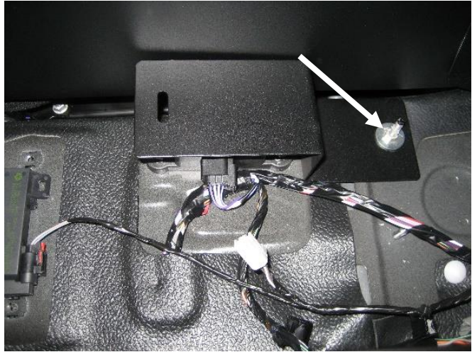
A cover is provided to guard the O.E.M. Sensor on transmission hump. If desired, attach to existing stud and 6mm nut and washer provided.

Havis, Inc. 75 Jacksonville Road Warminster, PA 18974 T 800-524-9900 F 215-957-0729 www.havis.com