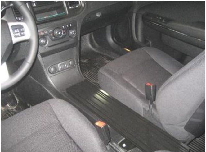
O.E.M. console prior to C-VS-0809-CHGR-2 console installation.