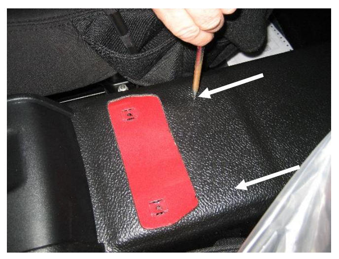
Locate inserts located under rubber mat as shown.