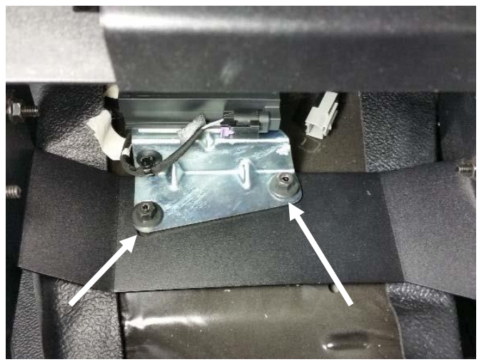
Sensor bracket will go on top of console, front floor bracket.

Havis, Inc. 75 Jacksonville Road Warminster, PA 18974 T 800-524-9900 F 215-957-0729 www.havis.com