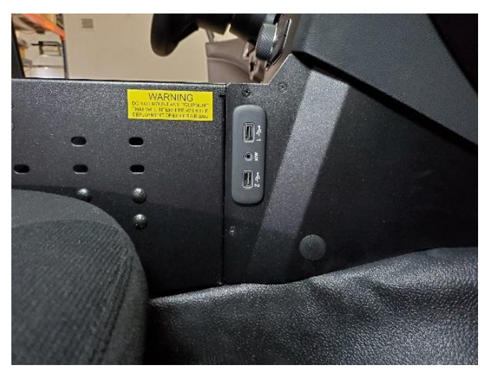
After connecting the aux panel wiring, snap panel into side trim panel.

Push Console assembly forward and tighten all floor mount, bracket hardware. Run all wiring as needed