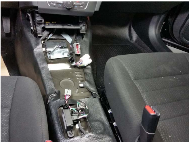
Plug O.E.M. wire harness back onto original connectors.