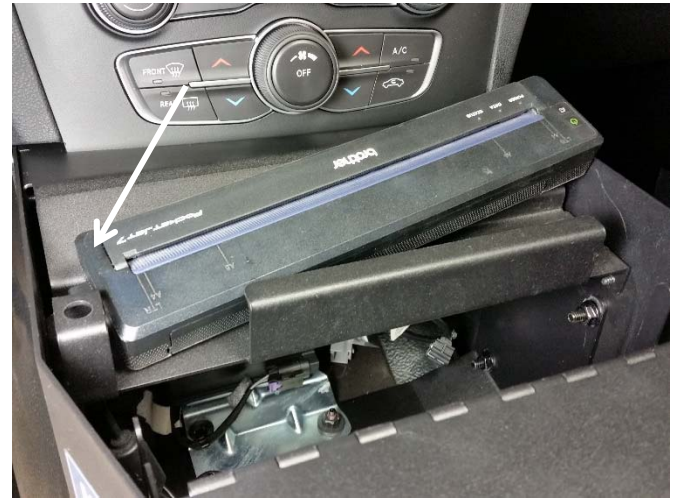
Pull USB and power cable connections through openings at the left of the printer mount bracket. Plug them into their respective locations and install printer into the mount.