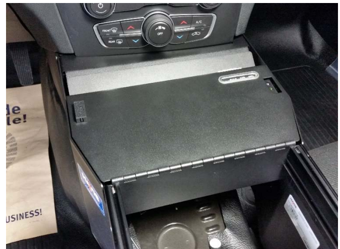
Close lid and confirm final operation, fit, and finish.