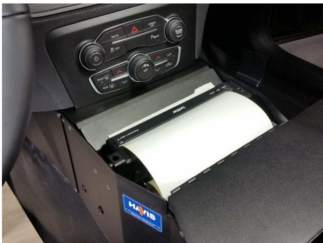
Install plastic rod (CM008426) through the paper spool and place into the console. Feed paper into the printer.