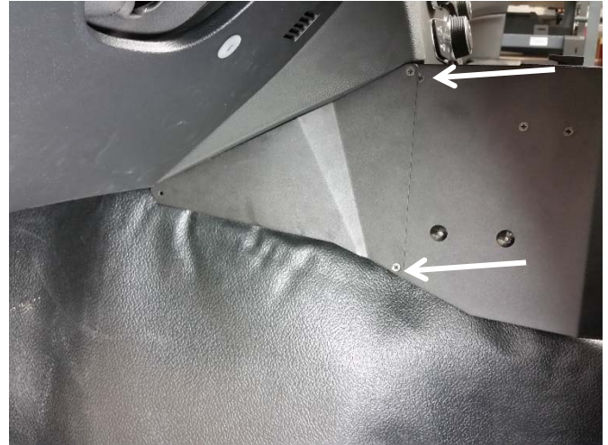
Attach driver side trim panel on with # 8 x 1/4 Flat head screws. (included with hardware kit)