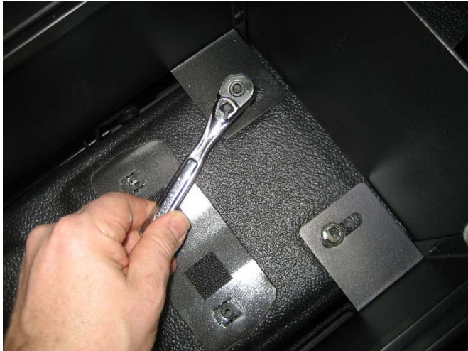
Use 1/4 x 3/4 self-threading screws (included in hardware kit) to loosely attach rear of console to existing floor inserts. Inserts located under rubber mat as shown. (7/16 socket)