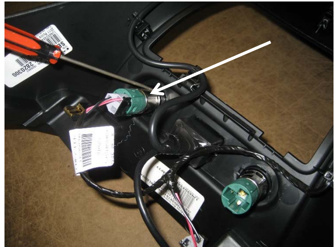
Remove OEM lighter plugs and AUX panel from factory center console.