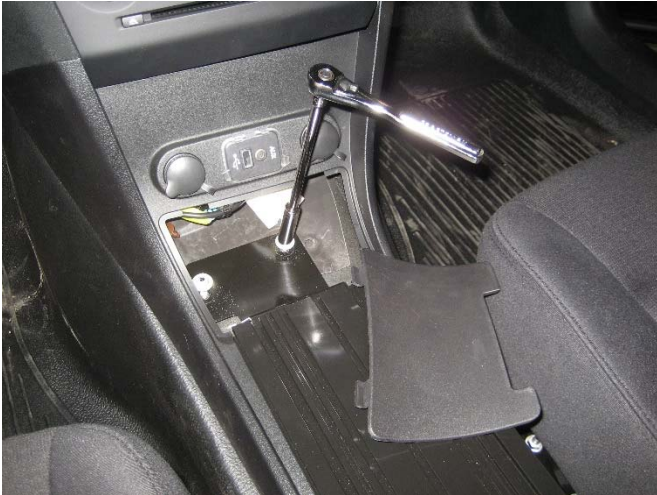
Remove forward O.E.M console plastic cover and remove two (2) nuts from front floor bracket. Nuts to be reused later. (10mm)