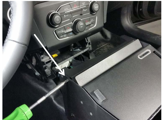
Attach the front printer trim panel (CM008185) using four (4) #8-18 x 1/4" flat head screws. (GSM33178)