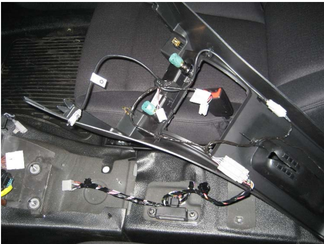
Remove O.E.M. plastic center console