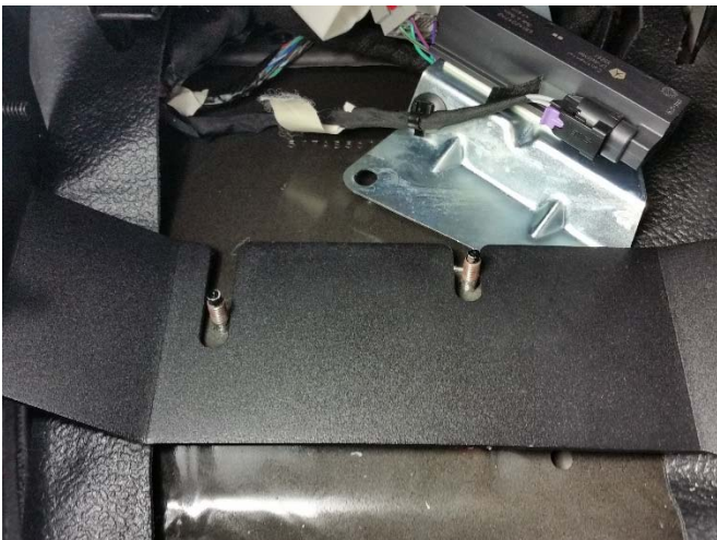
Make sure the ignition key sense module is moved out of the way and line up the U bracket to the OEM studs.