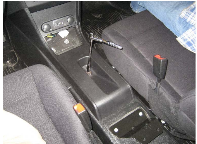
Remove bolts that hold underside of extrusion to rear floor bracket. (7/16 wrench) Remove rear floor bracket bolts and center console bolt. (10mm)