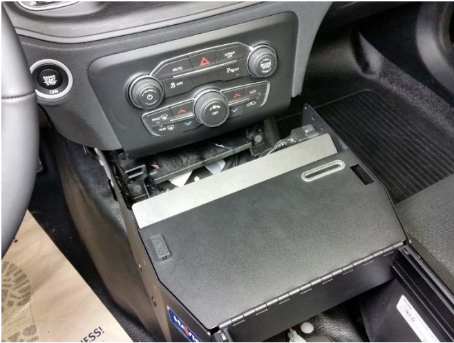
Slide console up to the dash leaving space for the next step.