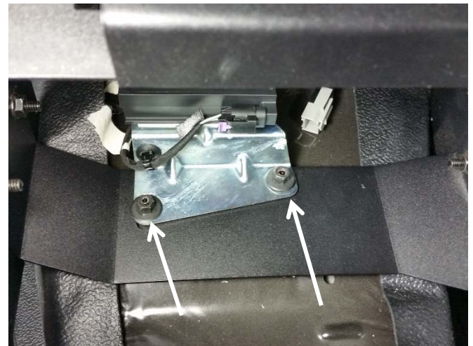
Place the ignition key sense module on the OEM studs and reinstall previously removed nuts.