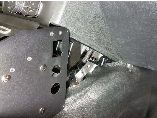
With the front printer trim panel installed place the console tight to the dash. It is easiest to pick up the rear of the console and slide it towards the dash and then lowering the rear.