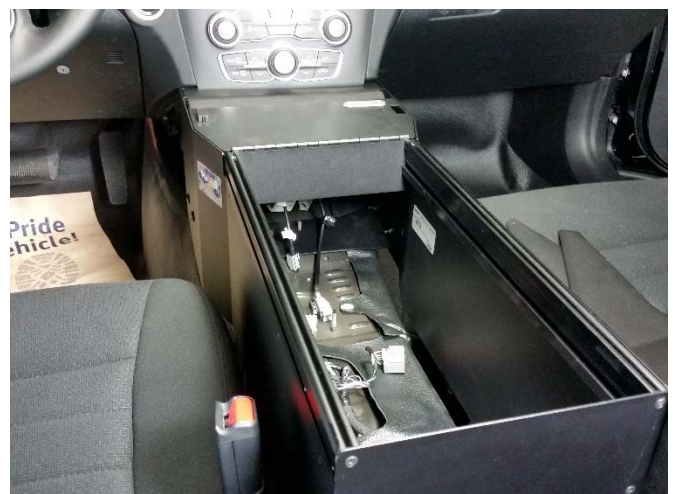
Place console housing into vehicle.