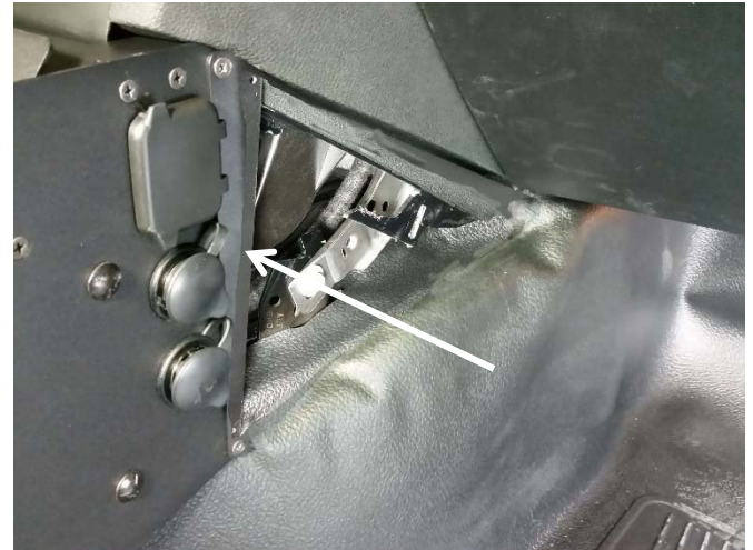
Install OEM AUX panel and 12V outlets into the side of the console. Plug into factory harnesses.