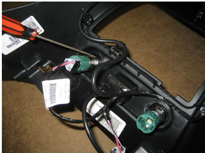
Remove OEM lighter plugs and AUX panel from factory center console.