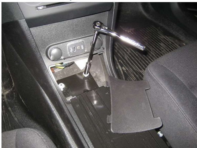
Remove forward O.E.M console plastic cover and remove two (2) nuts from front floor bracket. Nuts to be reused later. (10mm)