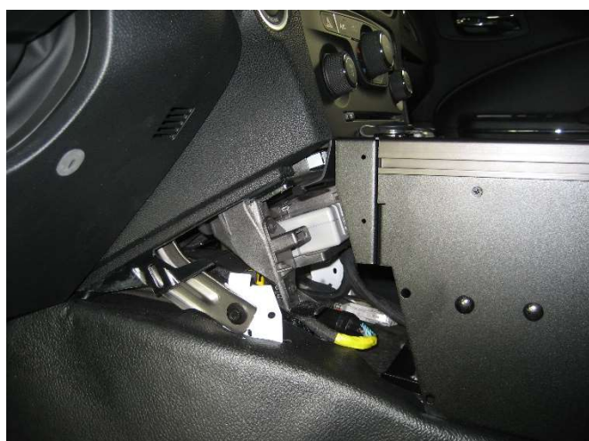
Place console housing into vehicle. Slide console up to the dash and loosely start previously removed nuts.