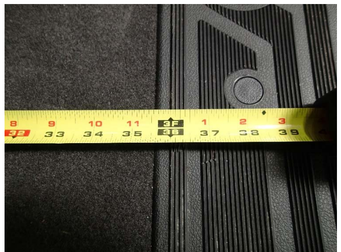
There will be approximately 36" of storage space behind the partition.