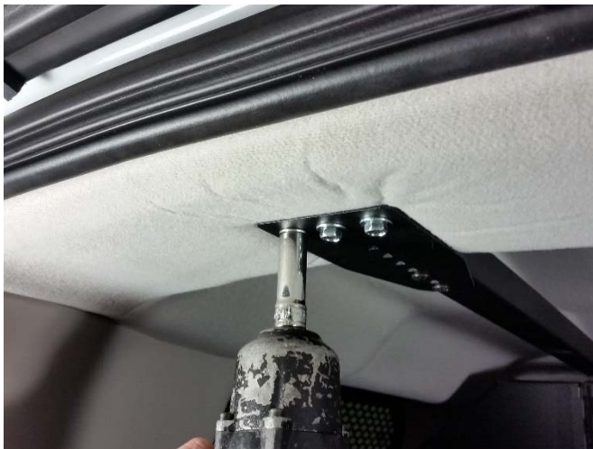
Attach upper mounting bracket to rear door header frame with 1/4" x 1" lag bolts.