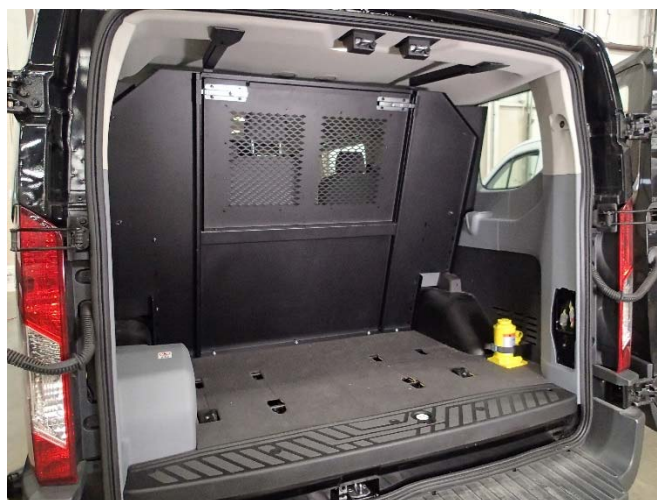
Completed P-REAR-3 with MFK-15 kit