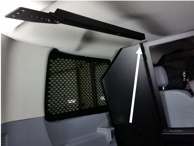
Attach upper mounting bracket to top of partition frame with 1/4" x 3/4" carriage bolts and nuts