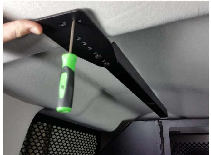
Verify sheet metal above headliner once bracket is lined up using a straight pick tool.