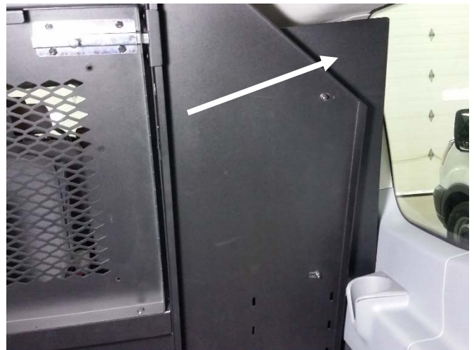
Attach upper and lower side filler panels with 1/4" x 3/4" carriage bolts and nuts. Tighten all hardware.