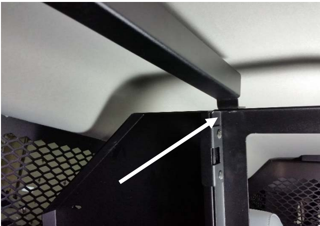
Place upper mounting bracket on the top of partition frame and attach using 1/4" x 3/4" carriage bolt and nut. Repeat process for passenger side

Note: Side panel sections must be temporarily unbolted in order to get main parts into place.