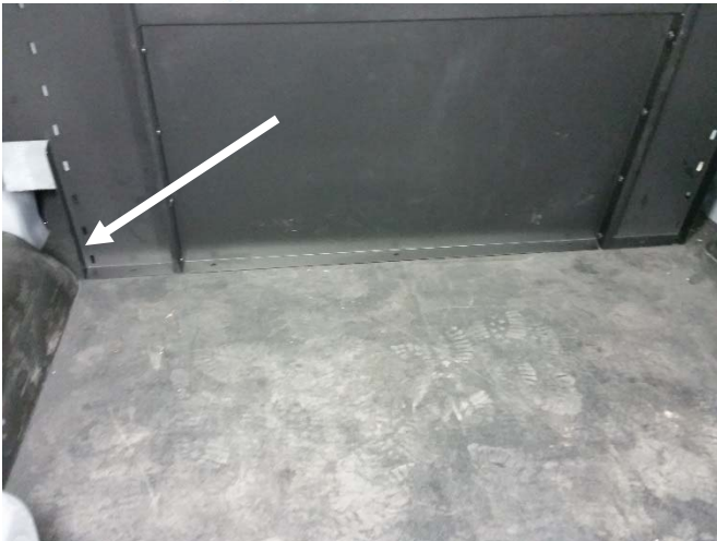
Determine lower placement of the partition in relation to the wheel wells