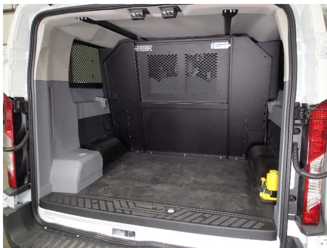
Completed P-REAR-3 with MFK-16 kit