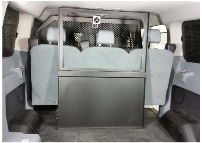
Install center of partition into the van.

Note: Side panel sections must be temporarily unbolted in order to get main parts into place.