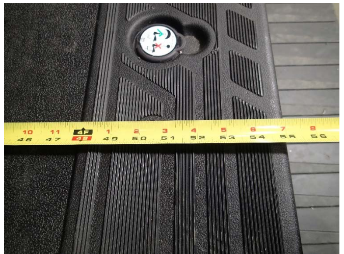
There will be approximately 48" of storage space behind the partition.