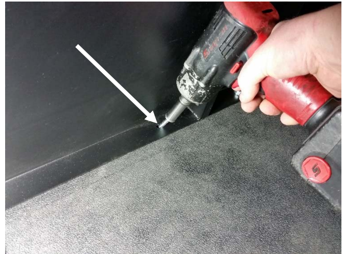
Attach partition to floor with 1/4" x 1" lag bolts.