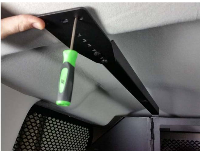
Verify sheet metal above headliner once bracket is lined up using a straight pick tool.