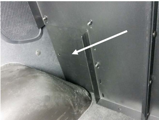
Attach lower side fillers to front of partition with 1/4" x 3/4" carriage bolts and nuts.