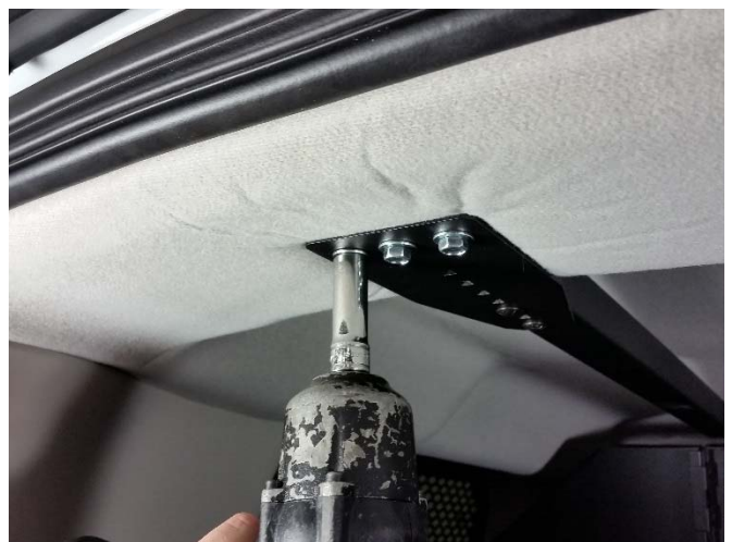
Attach upper mounting bracket to rear door header frame with 1/4" x 1" lag bolts.