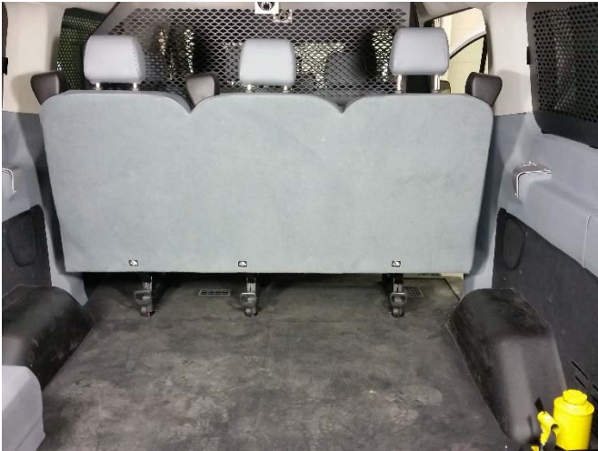
View of 130" wb 8 passenger van prior to install