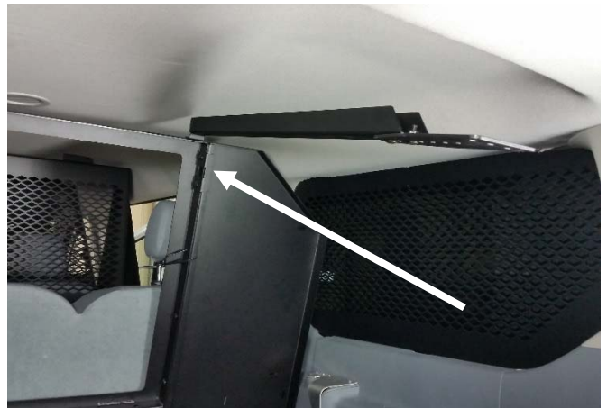
Reattach side panels to center section with 1/4" x 3/4" carriage bolts and nuts. Be sure to also reattach slide bolt reinforcement brackets.