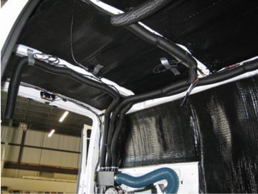
Installation with ribs and rear AC area not covered