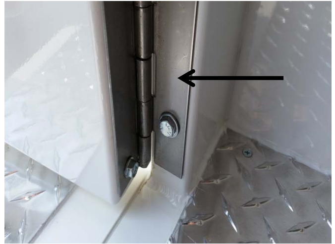
Mark the door frame roughly 2" above the lowest door hinge bolt