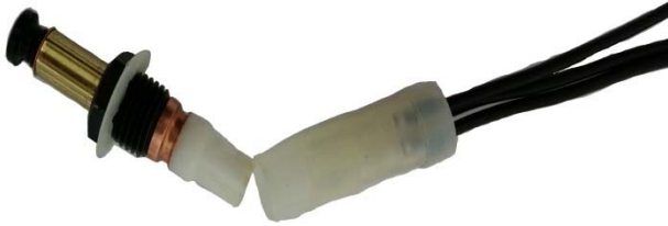
View of door plunger and wire harness