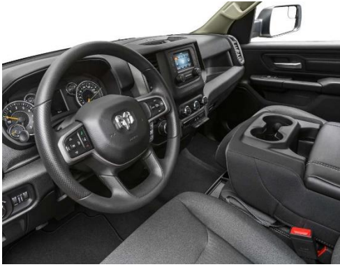
View of OEM interior prior to installation of C-VS-1014-RAM console.