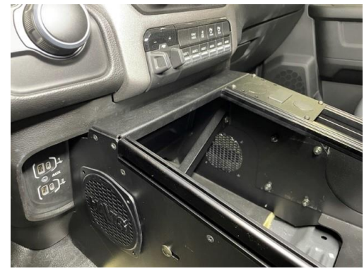
Position console up against lower center dash