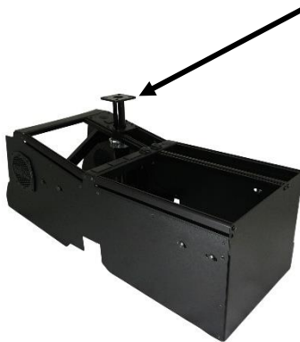
Optional C-HDM-214 pole can be installed at this time using the existing 1/4" x 3/4" carriage bolts in the side of console. Remove round knockout in pole face plate and attach plate to console around pole.