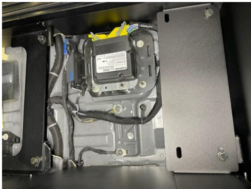
Attach console floor brackets to OEM seat brackets with 5/16-18 x 3/4" Hex bolts, flat washers, lock washers and nuts.