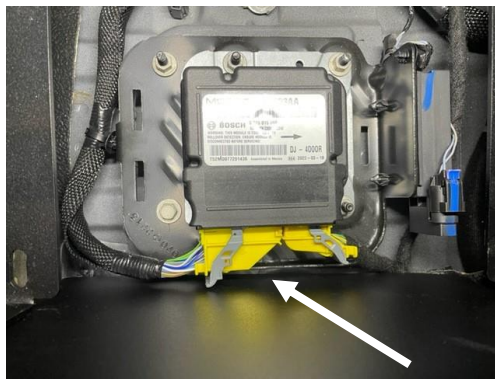
**Be careful not to damage OEM plugs and harnesses on transmission hump**