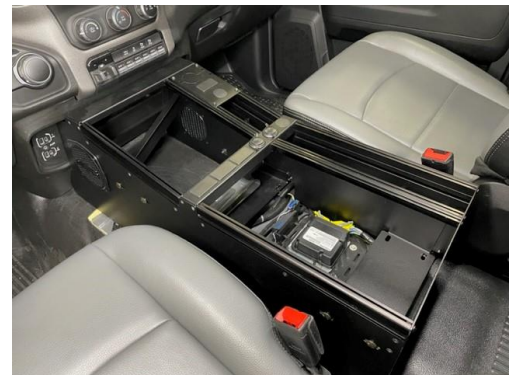
Console housing installed and ready to complete wiring, control head, and accessory installation. Slide 1/4-20 hex nuts (provided) into side extrusions as needed for side mounted accessories