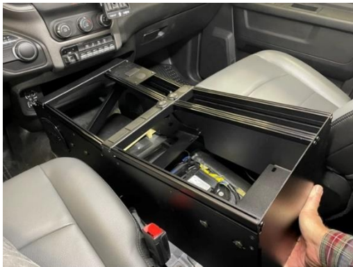
Carefully place console housing into vehicle on top of OEM center seat brackets.