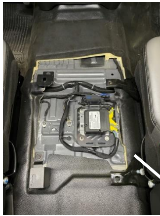
Remove center seat and front accessory pocket. Leave OEM center seat brackets in vehicle.