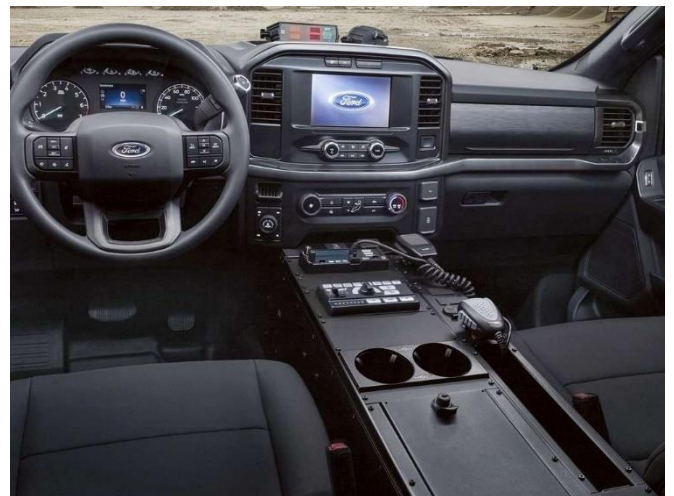
Console with computer installation complete.