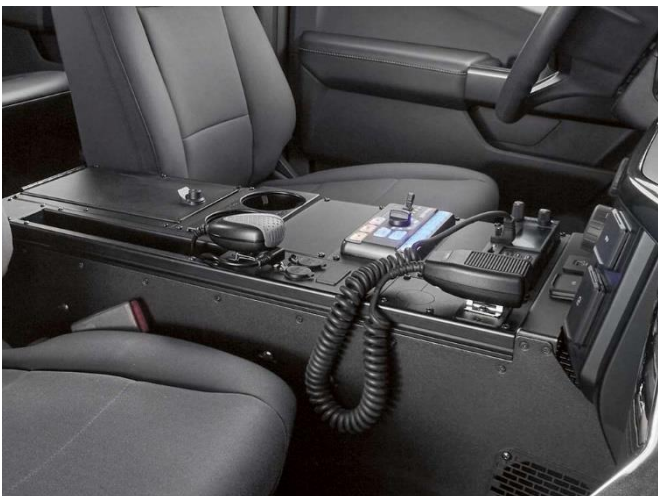
Console installation complete. C-VSW-3000-F150-2 shown.