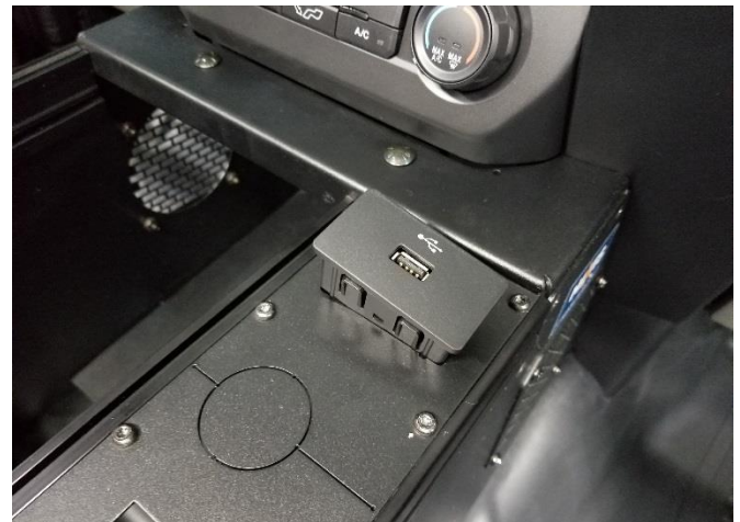
Install OEM AUX module into the console. Adaptor plate with #8 flat head screws provided for smaller Aux module. Blank plate provided if vehicle has no module for this location