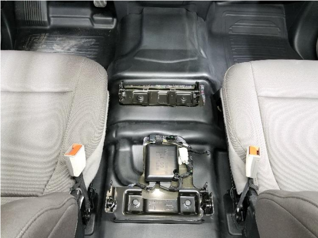
Remove factory center seat or mini console