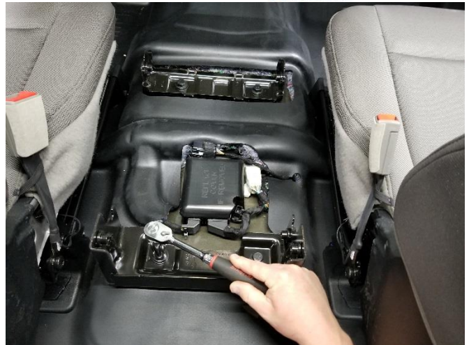
Unbolt factory bolts and save for later. 18mm socket