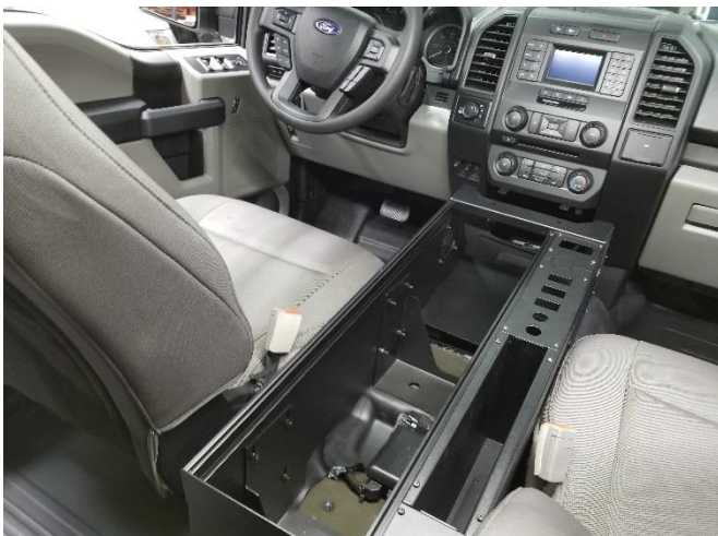
Place console with floor mount brackets into the vehicle. Shown with optional 3.3 wide panels and pocket.