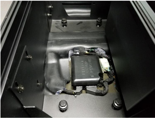
Loosely reinstall factory floor bolts through console floor brackets.