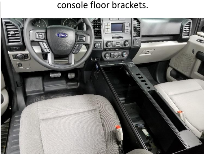
Main Housing installation is now complete. Install and wire equipment as desired.