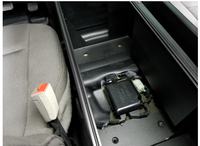
Slide console forward until the mounting brackets line up with the OEM mounting points in floor.