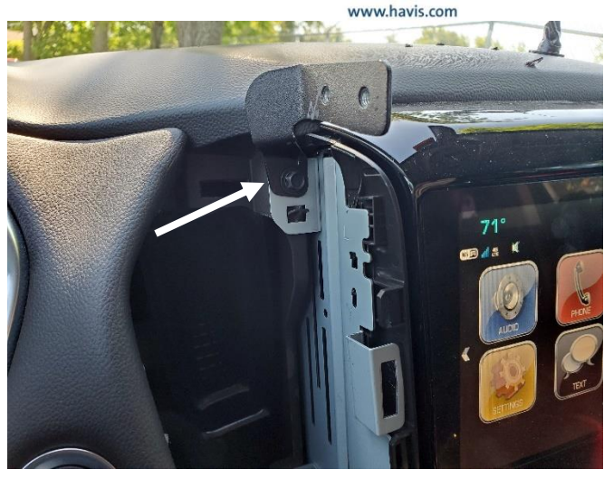
Remove OEM fastener and attach driver side upper mounting bracket.