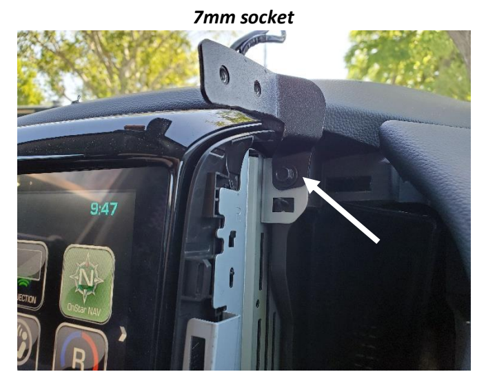
Remove OEM fastener and attach passenger side upper mounting bracket.