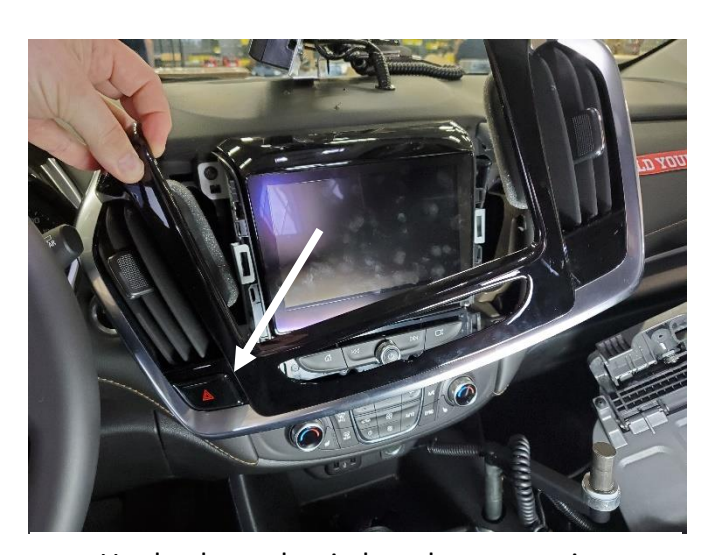
Unplug hazard switch and remove trim.