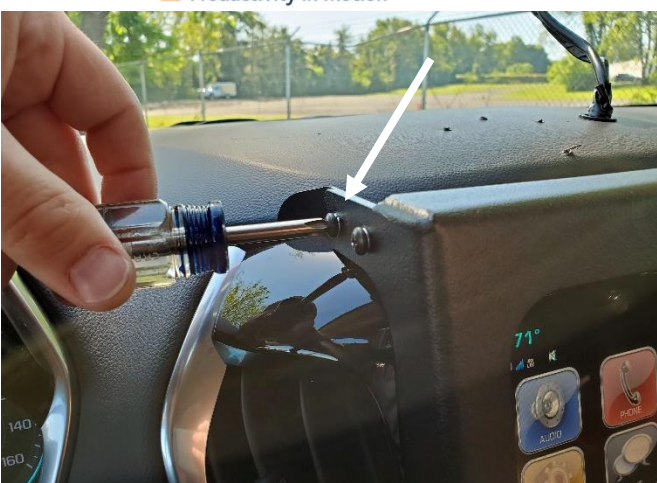
Place DMM frame onto mounting brackets and attach using 10-32 x 3/8" machine screw and flat washer.