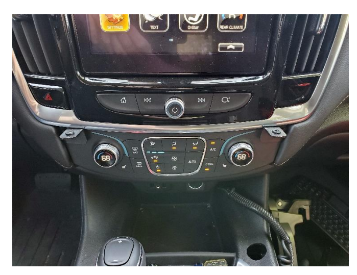
View of lower mounting bracket with trim fully snapped back in.