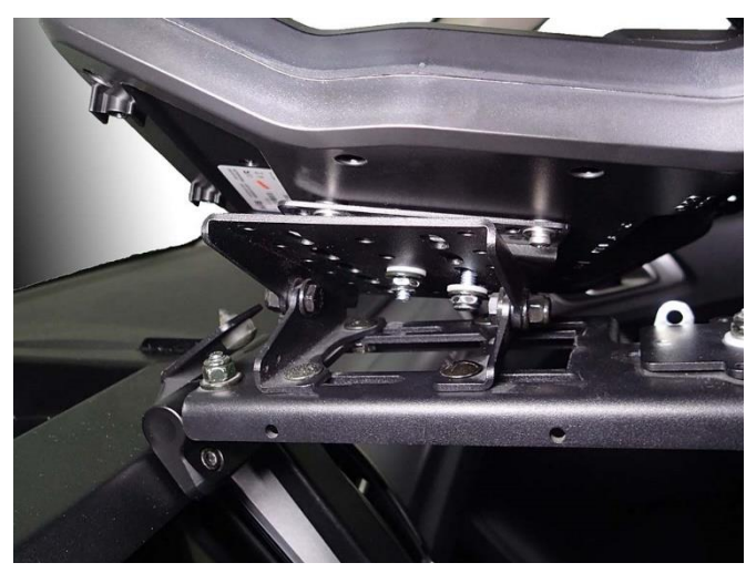
Determine desired position for your specific computer and attach to DMM swivel plate using 1/4"x 3/4" carriage bolts, PVC spacer, nylon washers, steel washers, and nylock nuts. Tighten so that the dock rotates smoothly.