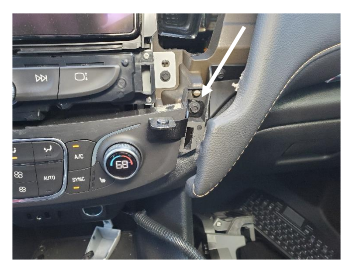
Remove OEM fastener and attach passenger side lower mounting bracket.