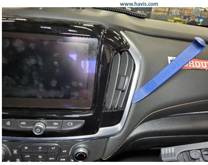
Carefully pry along sides of trim with a panel removal tool.