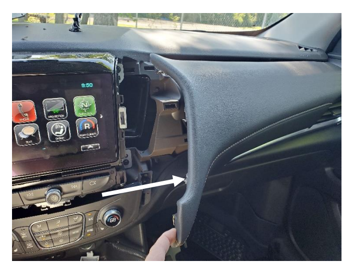
Unclip and pull back trim on passenger side. This does not need to be fully removed.