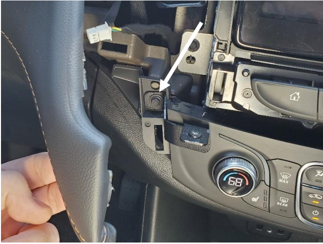
Remove OEM fastener and attach driver side lower mounting bracket.

Havis, Inc. 75 Jacksonville Road Warminster, PA 18974 T 800-524-9900 F 215-957-0729