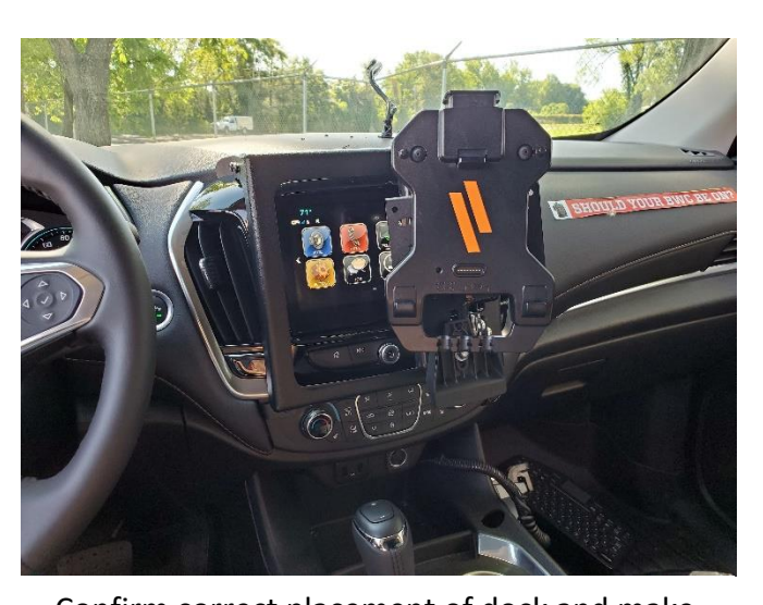
Confirm correct placement of dock and make sure rotation movement is smooth and latching works correctly.