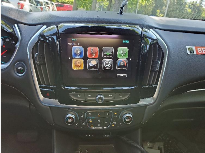
View of Traverse dash prior to install.