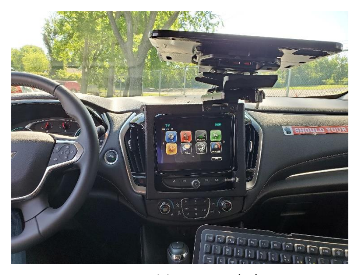
Route wiring as needed.