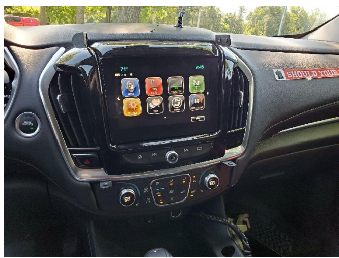
Plug in hazard switch and place trim back onto dash.