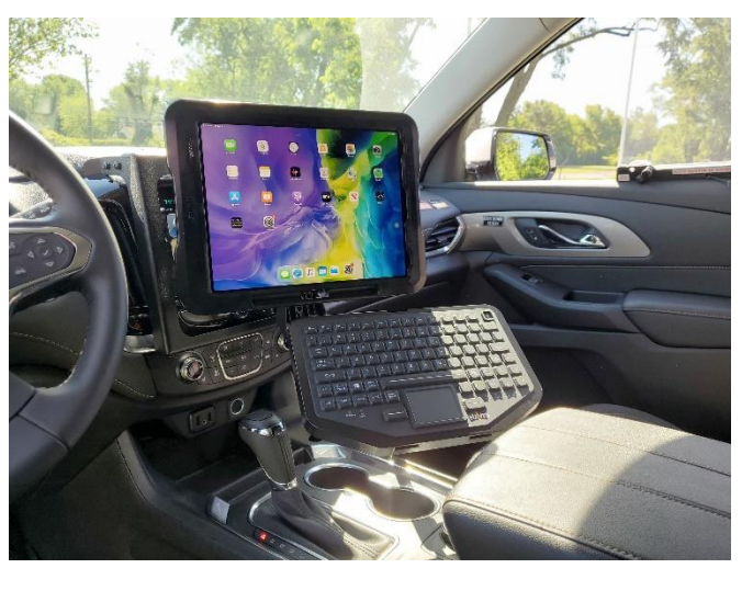
Installation is now complete.