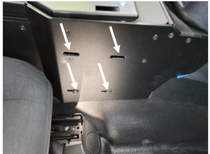
Attach passenger side of console to front mounting bracket with 1/4" x 3/4" carriage bolts and nuts.