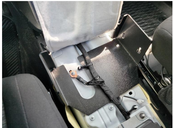
Once the bracket has been slid under the harness, reinstall ground wire back onto stud using previously removed nut.