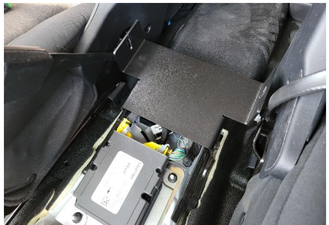
Place rear mounting bracket over rear mounting tabs.