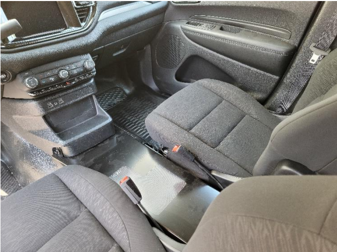
Remove the OEM tunnel plate from the center. Retain the (4) 10mm head bolts for later use.