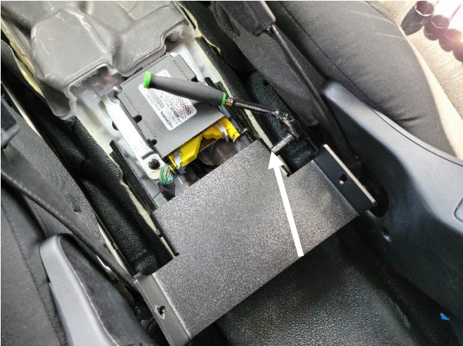
Attach rear mounting bracket using previously removed 10mm head fasteners.