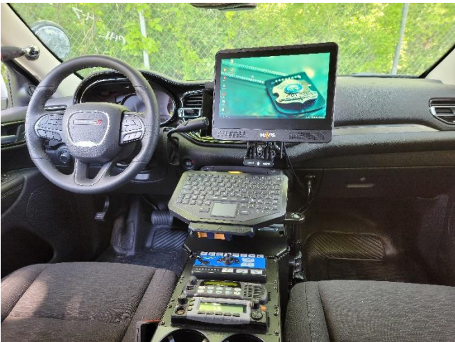
C-VS-1900-DUR-PM console shown with C-DMM-3024, TSD-201 and PKG-KB-208.