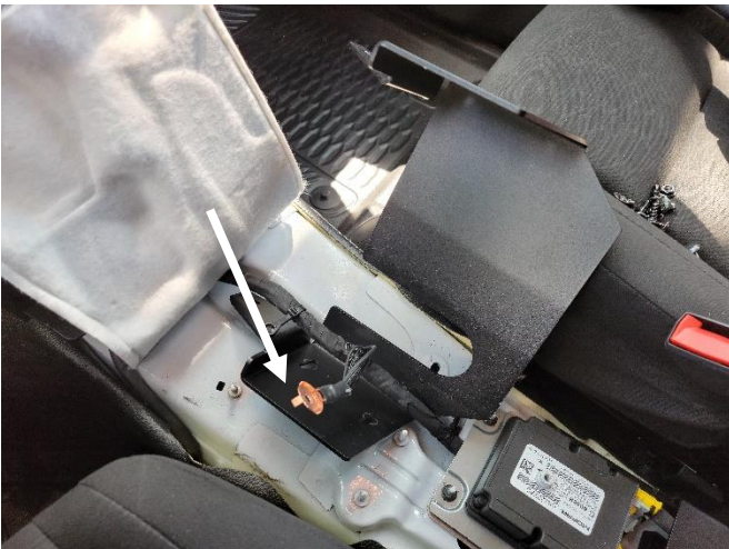
Slide forward mounting bracket under OEM harness and ground stud.