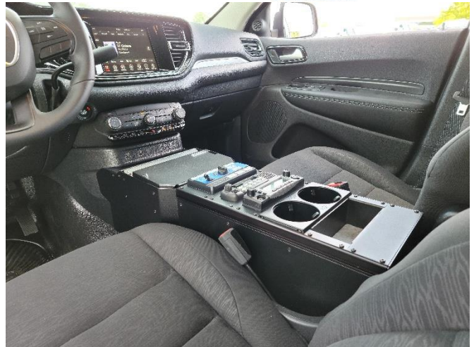
Wire and install all equipment.