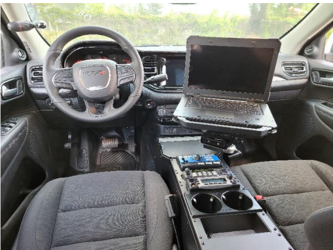
C-VS-1900-DUR-PM console shown with C-MD-119 and C-HDM-204.