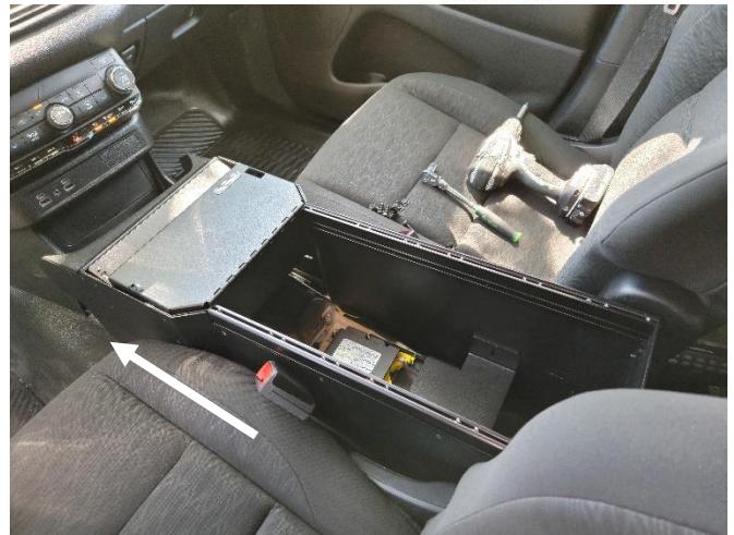
Place console housing over front and rear mounting brackets and slide towards dash.