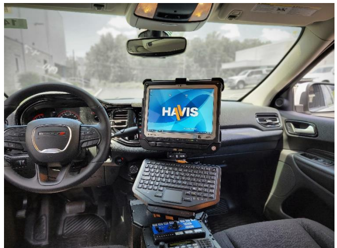
C-VS-1900-DUR-PM console shown with C-DMM-3024, PKG-MD-ARM-0603 and PKG-KB-208.