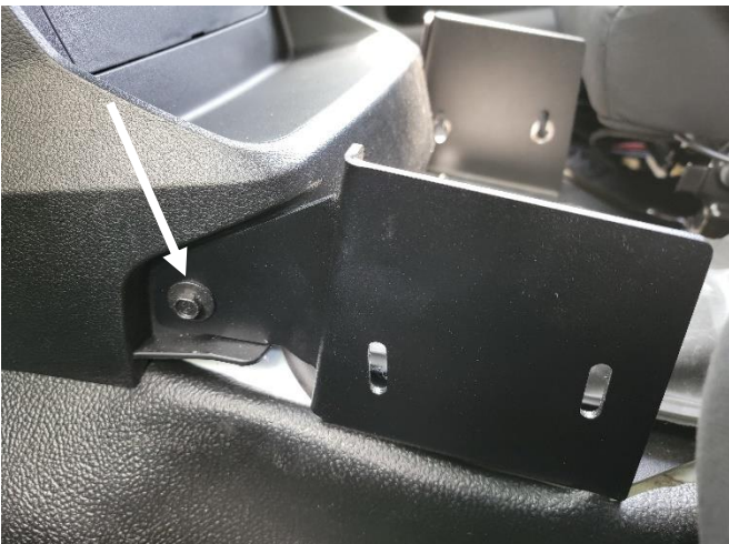
Line front of bracket up to center dash. Attach using previously removed 10mm head fasteners.