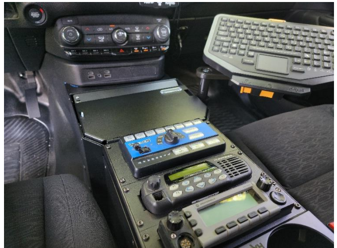
C-VS-1900-DUR-PM console shown with PKG-MD-ARM-0603 and PKG-KB-208.