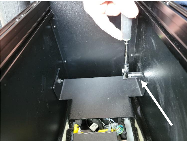
Attach rear of console to rear mounting bracket with 1/4" x 3/4" carriage bolts and serrated nuts.