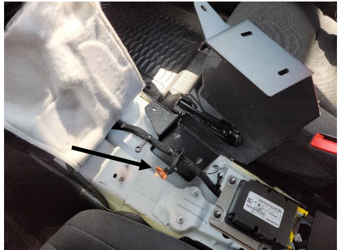
Remove the nut for the factory ground wire and unclip harness.