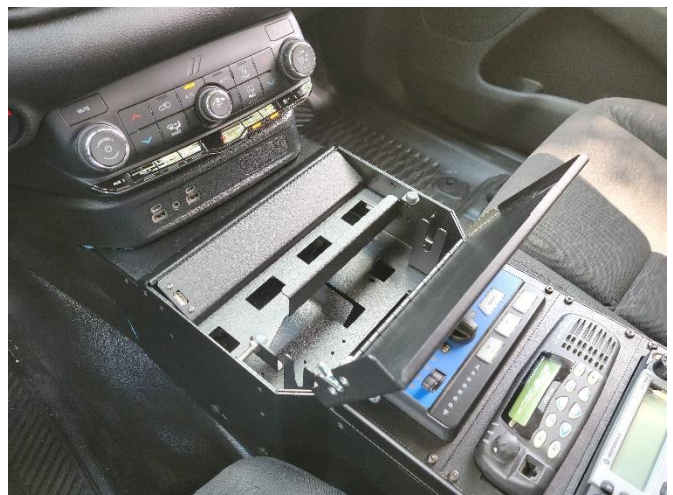
Run wiring for printer through left side of printer bracket opening.