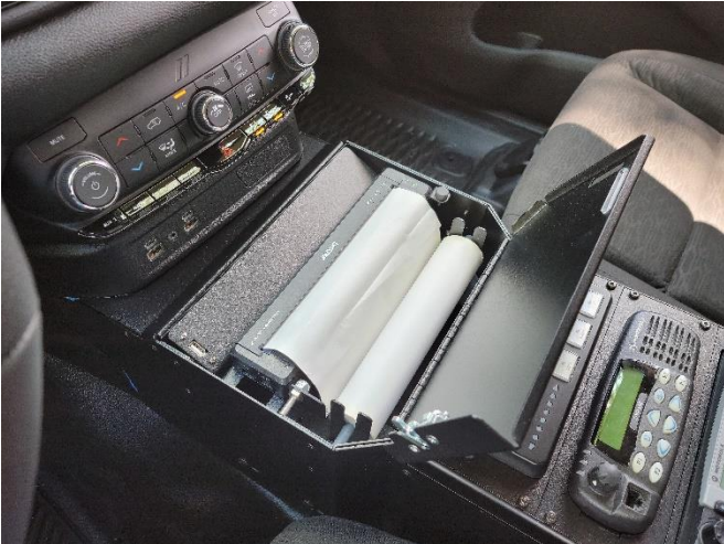
Install Brother PocketJet 7 and paper roll into printer holder.