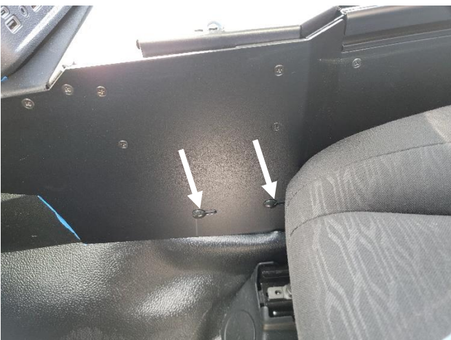
Attach driver side of console to front mounting bracket with 1/4" x 3/4" carriage bolts and nuts.