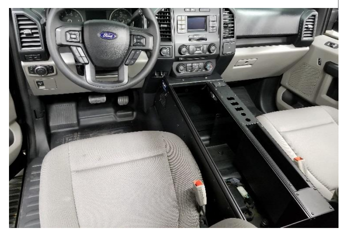
Main Housing installation is now complete. Install and wire equipment as desired.