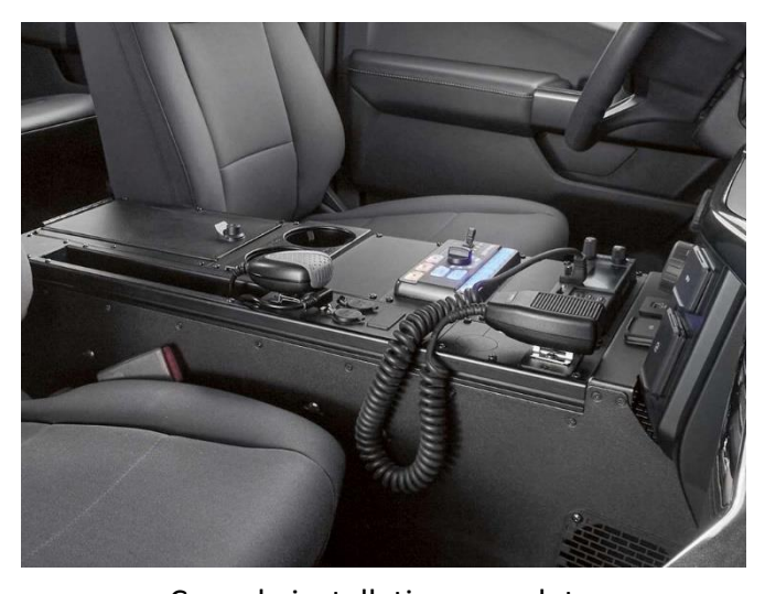
Console installation complete.