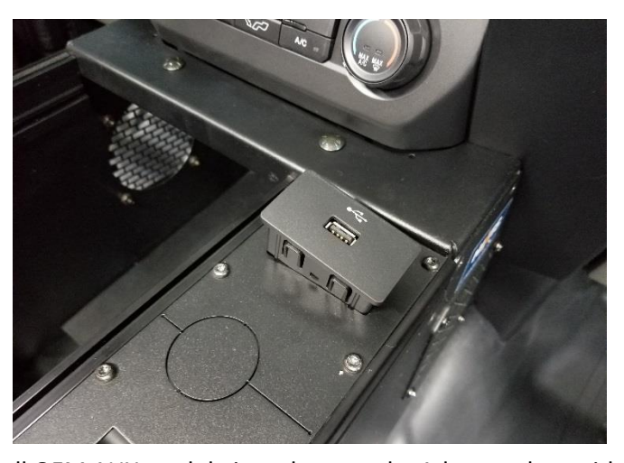
Install OEM AUX module into the console. Adaptor plate with #8 flat head screws provided for smaller Aux module. Blank plate provided if vehicle has no module for this location.