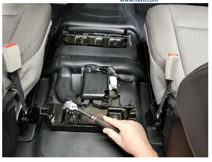
Unbolt factory bolts and save for later. 18mm socket

Havis, Inc. 75 Jacksonville Road Warminster, PA 18974 T 800-524-9900 F 215-957-0729 www.havis.com