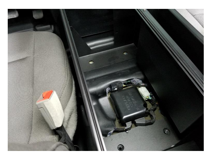
Slide console forward until the mounting brackets line up with the OEM mounting points in floor. Loosening brackets from console may help with alignment.