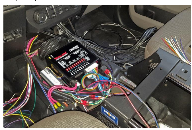
Electrical accessory mounting plate shown. Unbolting and sliding console back for component installation is recommended.