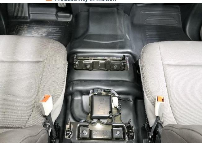
Remove factory center seat or mini console