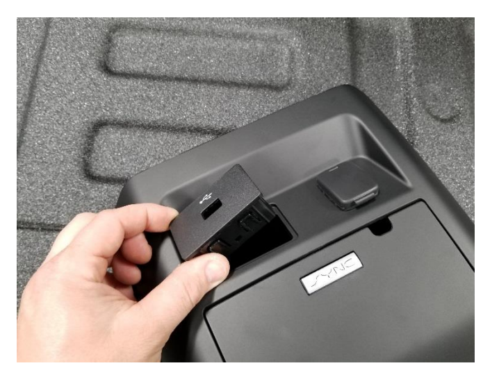
Remove OEM AUX module from dash and save to be reused.