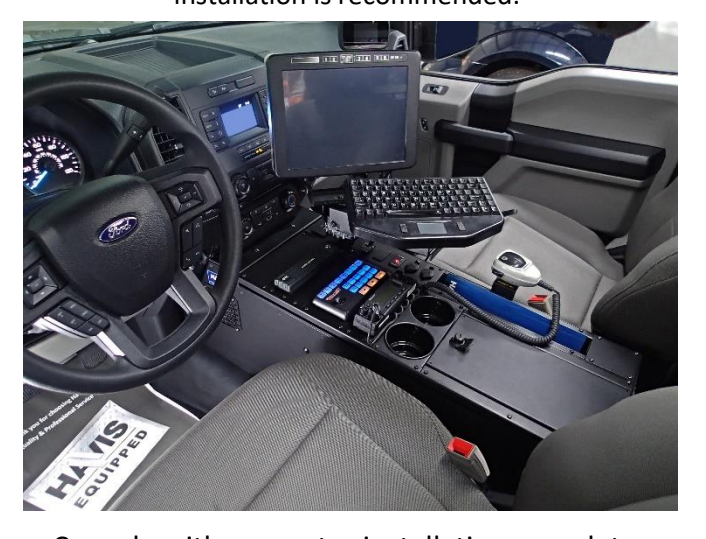
Console with computer installation complete.