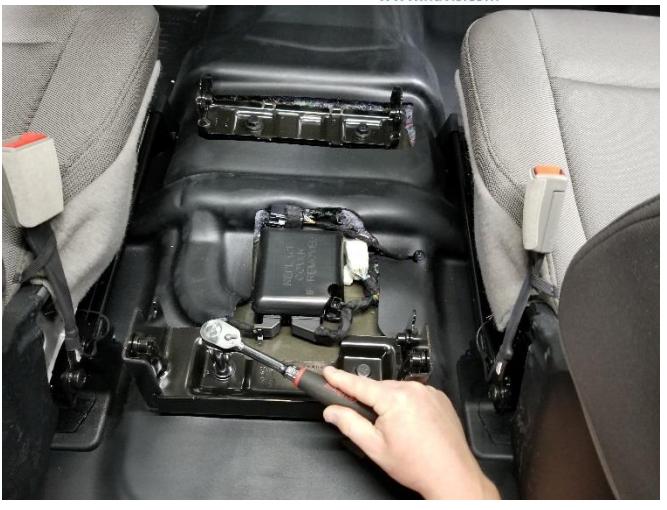
Unbolt factory bolts and save for later. 18mm socket

Havis, Inc. 75 Jacksonville Road Warminster, PA 18974 T 800-524-9900 F 215-957-0729 www.havis.com