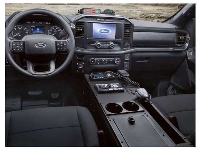
Console with computer installation complete.