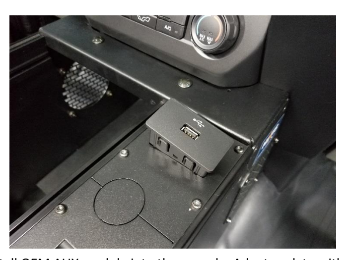
Install OEM AUX module into the console. Adaptor plate with #8 flat head screws provided for smaller Aux module. Blank plate provided if vehicle has no module for this location