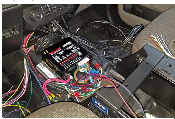
Electrical accessory mounting plate shown. Unbolting and sliding console back for component installation is recommended.