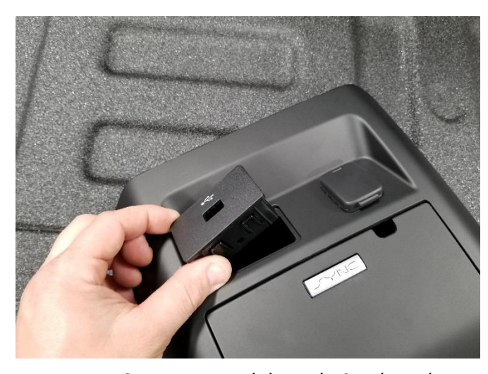
Remove OEM AUX module and 12 volt socket from dash and save to be reused.