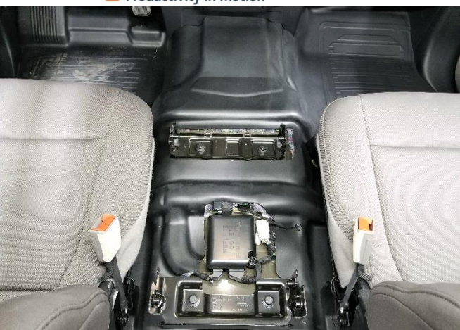
Remove factory center seat or mini console.

Note: Seat belts (for center seat) must be left in vehicle and plugged back into OEM harness. Wire tie seat belts out of the way as desired.