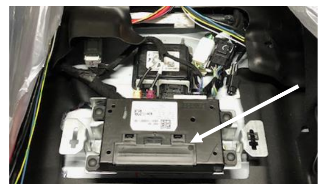
NOTE: Some vehicles include an OEM SmartLink / Telematics module mounted to transmission hump using the same bolts needed for the rear console bracket.

Note: Seat belts (for center seat) must be left in vehicle and plugged back into OEM harness. Wire tie seat belts out of the way as desired.