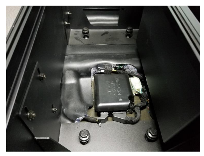
Loosely reinstall factory floor bolts through console floor brackets.