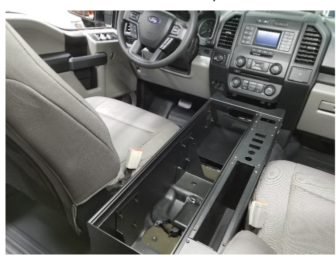
Place console with floor mount brackets into the vehicle. Shown with optional 3.3 wide panels and pocket.

The OEM module must be unbolted and simply relocated under console by installer as desired. Relocating OEM module will not affect OEM system.