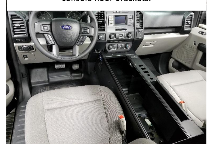
Main Housing installation is now complete. Install and wire equipment as desired.