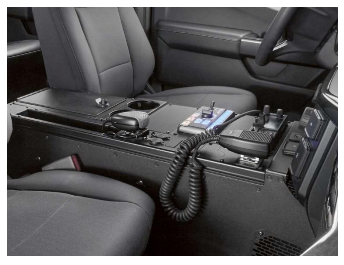
Console installation complete. C-VSW-3000-F150-3 shown.